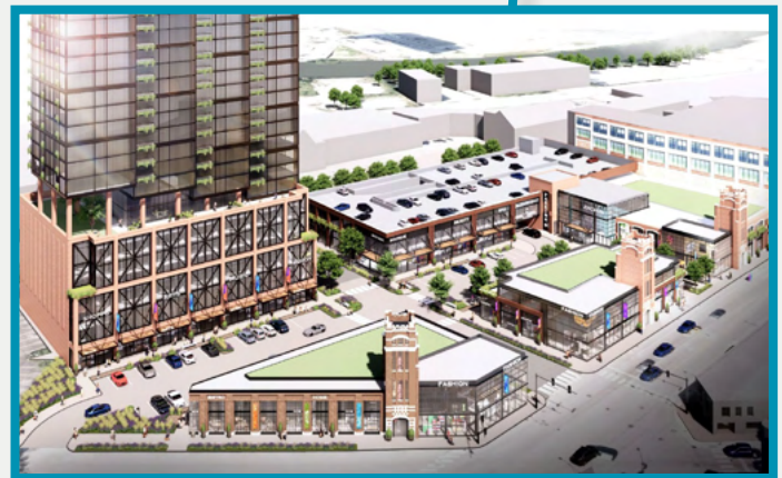
1229 West Cortland is just two blocks north of another large development, the Willow Street District . Comprised of a 4-building, 62,000 SF retail redevelopment and enhanced parking for nearly 500 cars, the site will also include two towers totaling 550 new residential units.