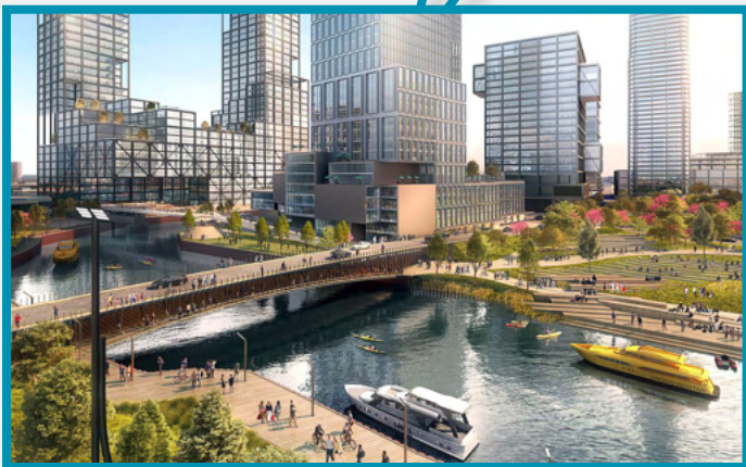
1229 West Cortland sits across the street from Lincoln Yards' southern border street. Lincoln Yard is a new 53-acre mixed-use community that totals 14.5 million square feet of mixed-use development and includes up to 6,000 residential units. It will be a hub to the adjacent neighborhoods, connecting residential, retail, parks, waterways, rail, roads and bus lines throughout the city and the region.