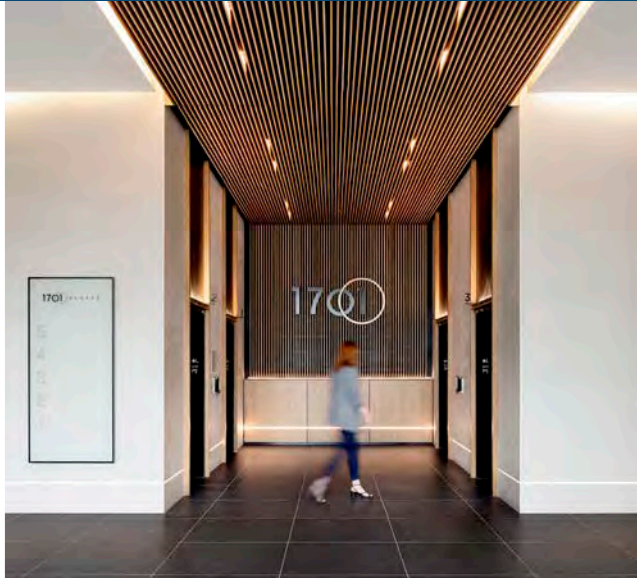
LOBBY ELEVATOR ENTRY