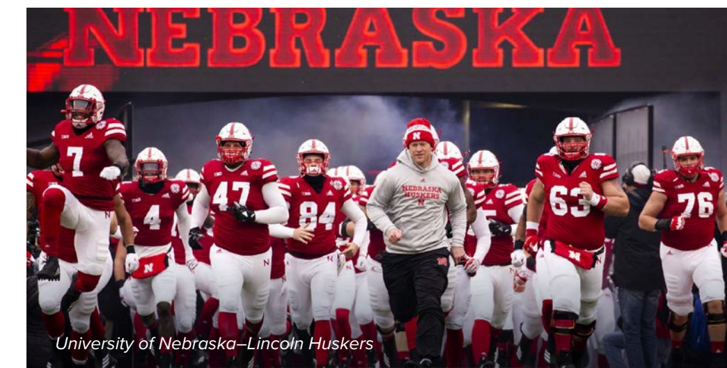
University of Nebraska–Lincoln Huskers

In addition to education-driven activity, Lincoln benefits from a substantial public-sector and healthcare employment base that provides year-round economic balance. State government offices and agencies employ thousands of residents, contributing consistent income levels that help insulate the local economy from broader economic volatility. Major healthcare providers, research institutions, and regional employers further support household stability and predictable consumer spending patterns, reinforcing demand for neighborhood-serving retail and quick-service dining.