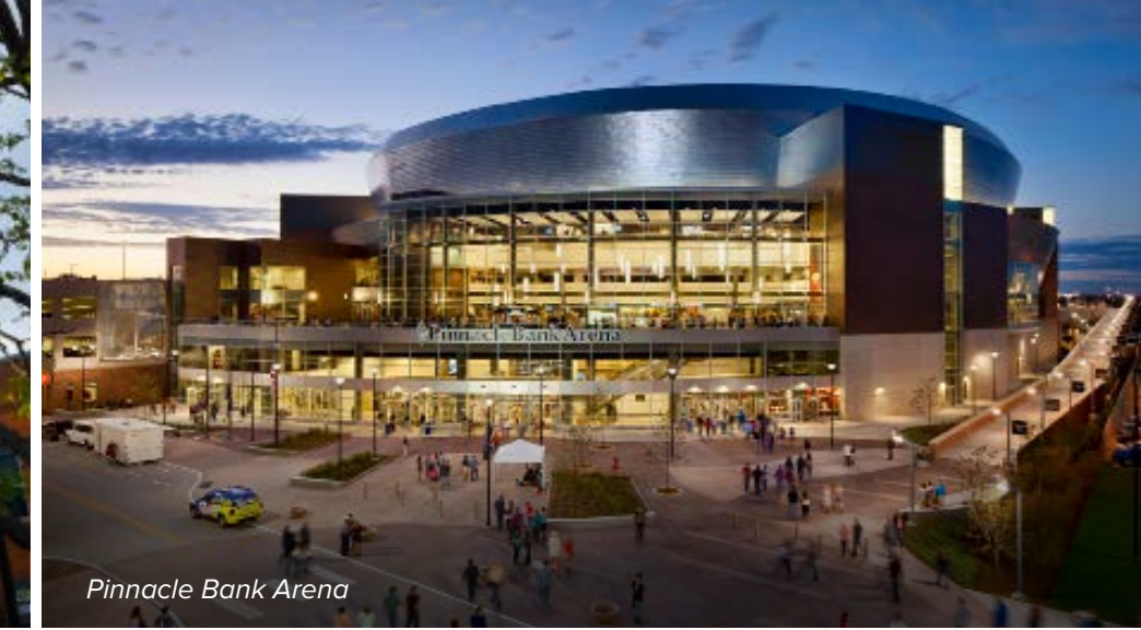
Pinnacle Bank Arena