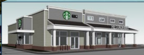
NEW PAD BUILDING WITH STARBUCKS

This shopping center in Long Island's affluent North Shore, is anchored by national co-tenant brands (including Target, TJ Maxx, and Walgreens), and faces beautiful Manhasset Bay.