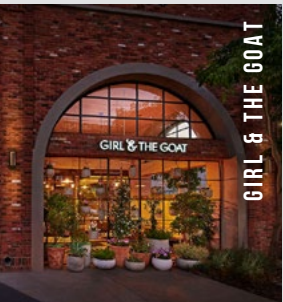
GIRL & THE GOAT