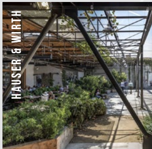
HAUSER & WIRTH