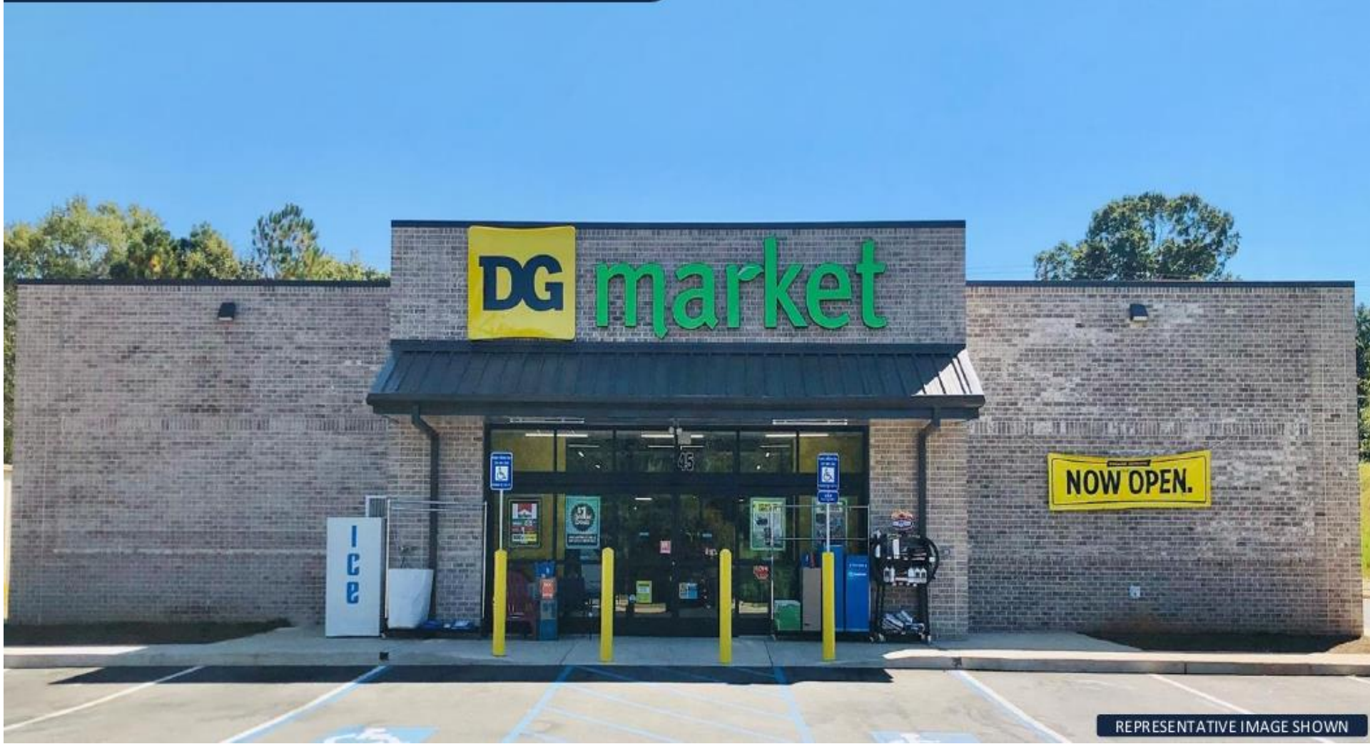
REPRESENTATIVE IMAGE SHOWN