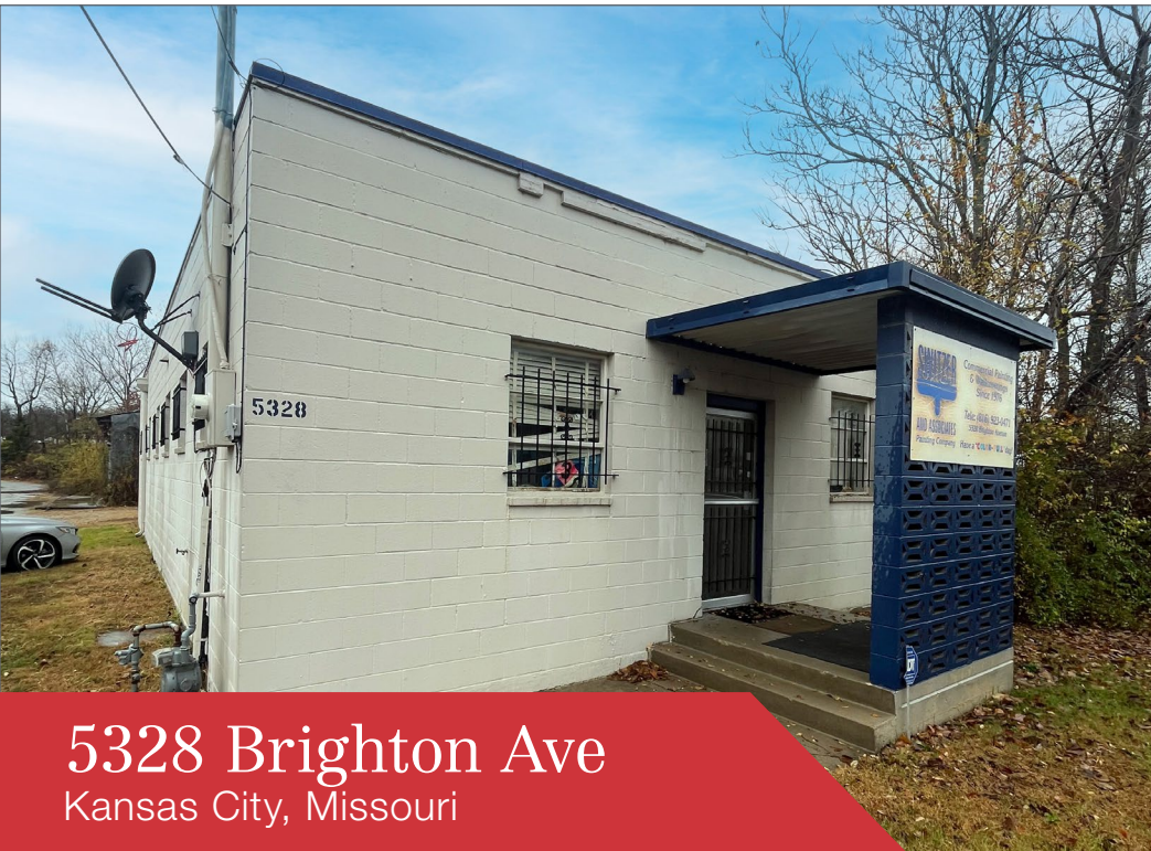
5328 Brighton Ave Kansas City, Missouri