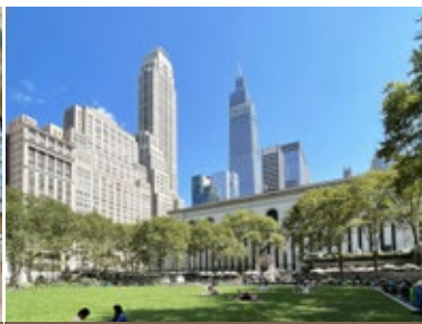
Blocks from Bryant Park