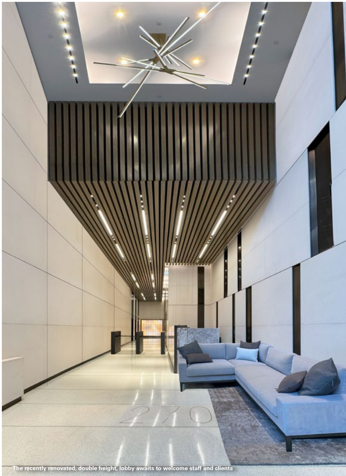
The recently renovated, double height, lobby awaits to welcome staff and clients