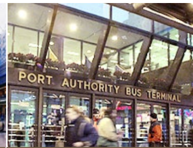
Port Authority Bus Terminal