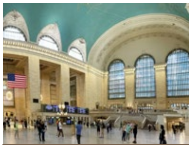
Walk to Grand Central Terminal