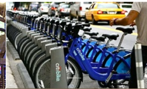
CitiBike Stations Nearby