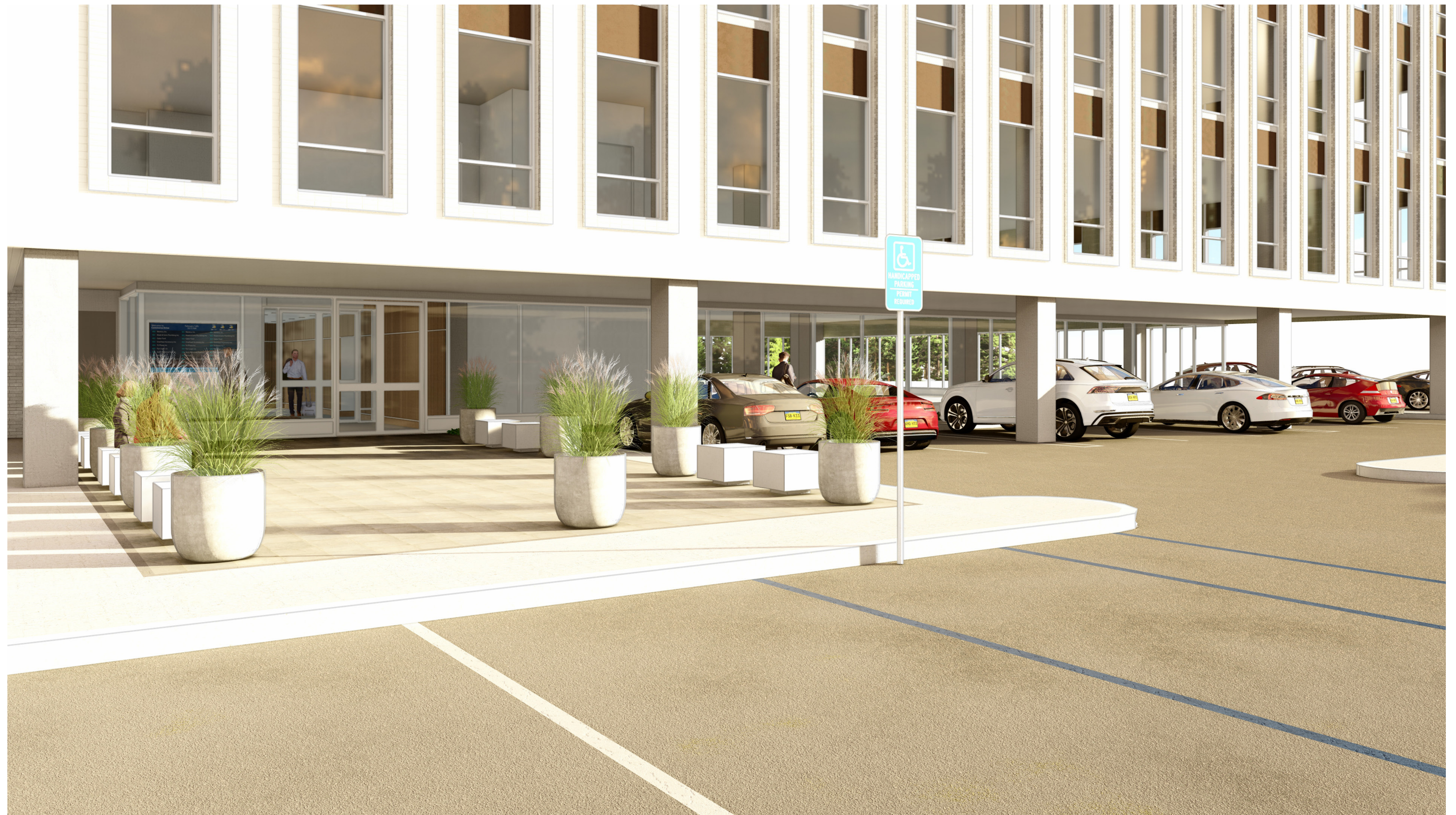
PROPOSED WEST ENTRANCE - PERSPECTIVE