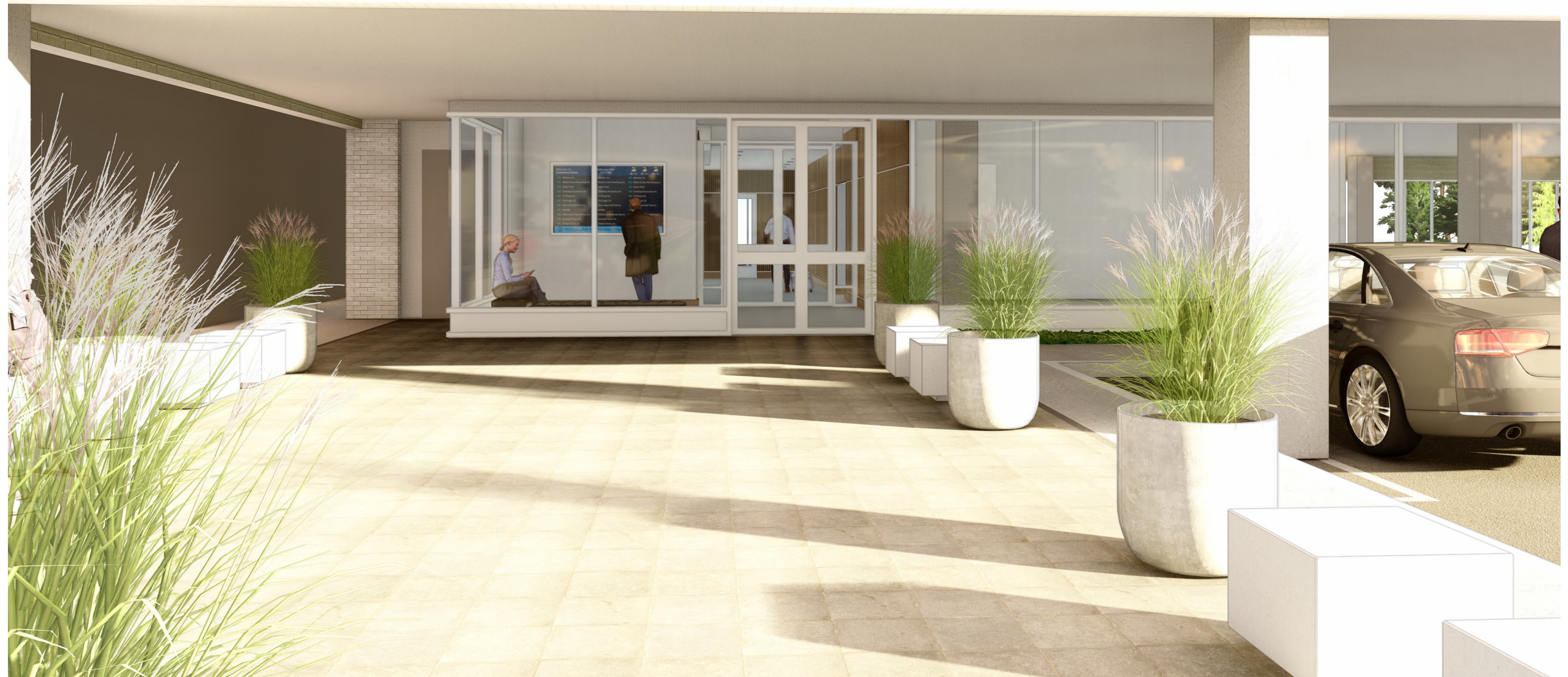
PROPOSED WEST ENTRANCE - PERSPECTIVE