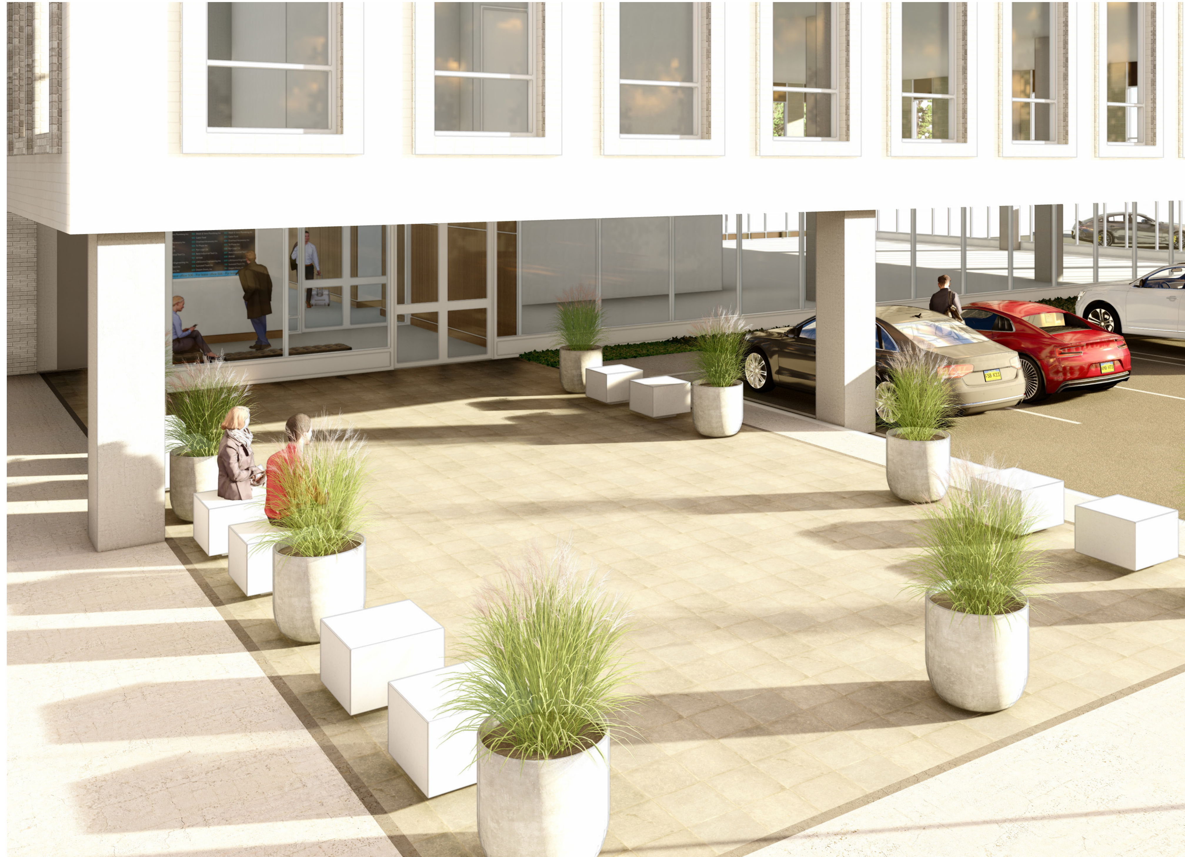
PROPOSED WEST ENTRANCE