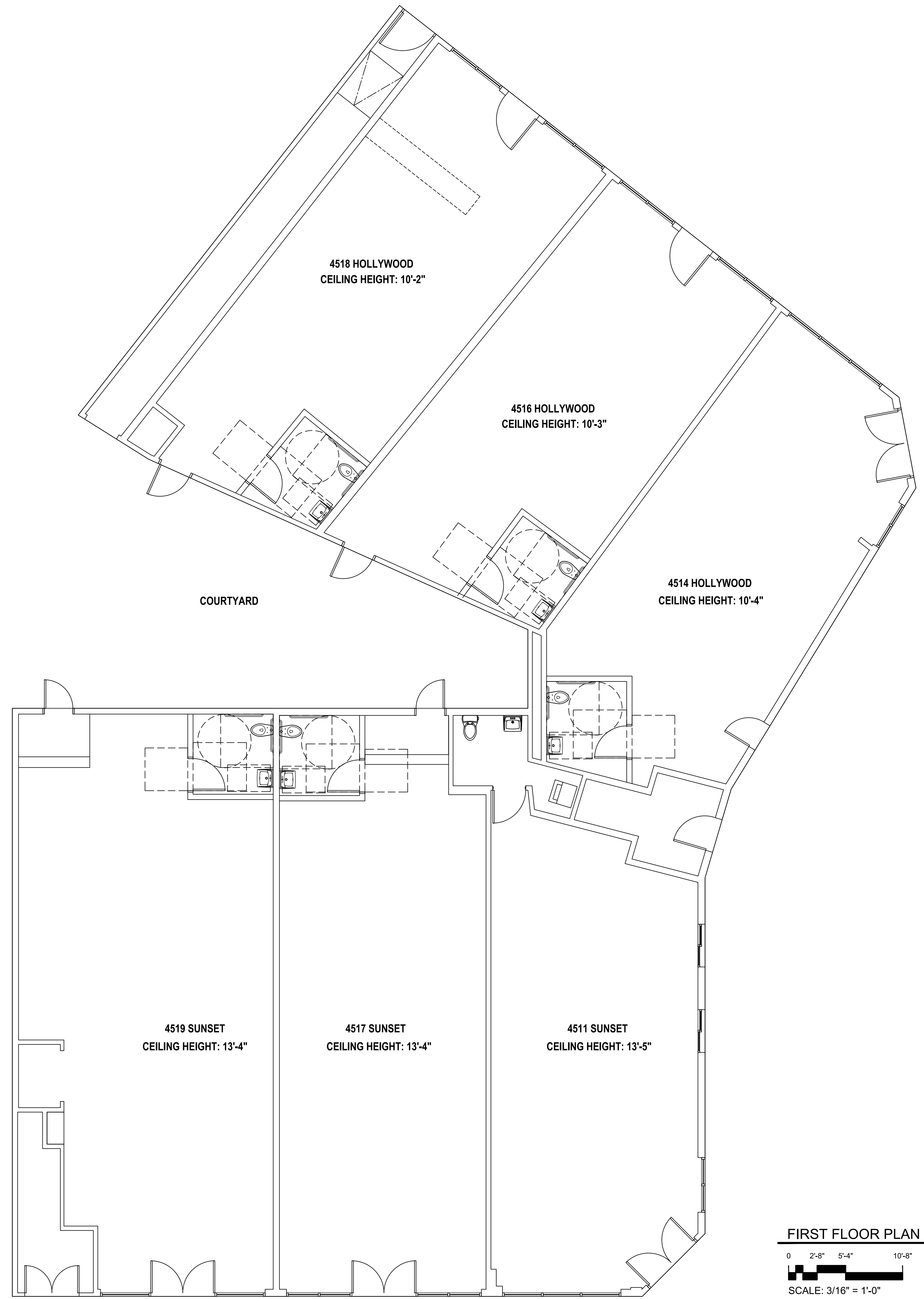
FIRST FLOOR PLAN 0 2'-8" 5'-4" 10'-8" SCALE: 3/16" = 1'-0"