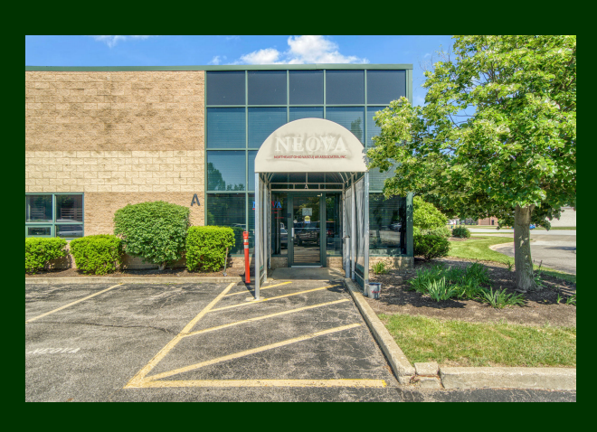
36445 Biltmore Place, Unit A, Willoughby, OH 44094

No warranty or representation, express or implied, is made as to the accuracy of the information contained herein. It is submitted subject to errors, omissions, price changes, rental or other conditions, withdrawal without notice, and to any special listing conditions imposed by our client.