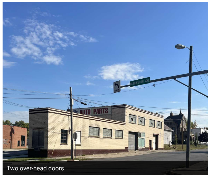
Two over-head doors