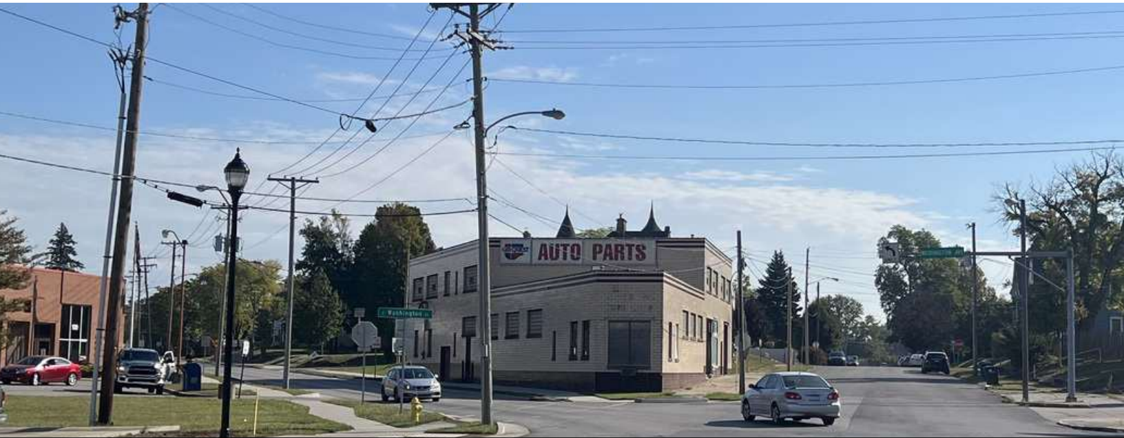
Located close to Downtown Frankfort