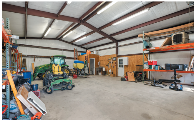
Interior of workshop