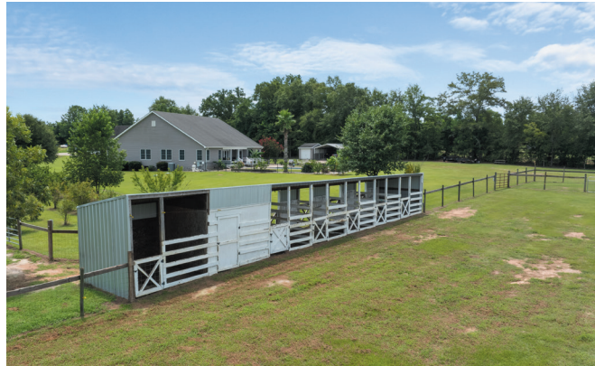
Stable with pasture