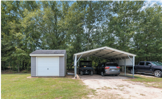
Wash station and pump house