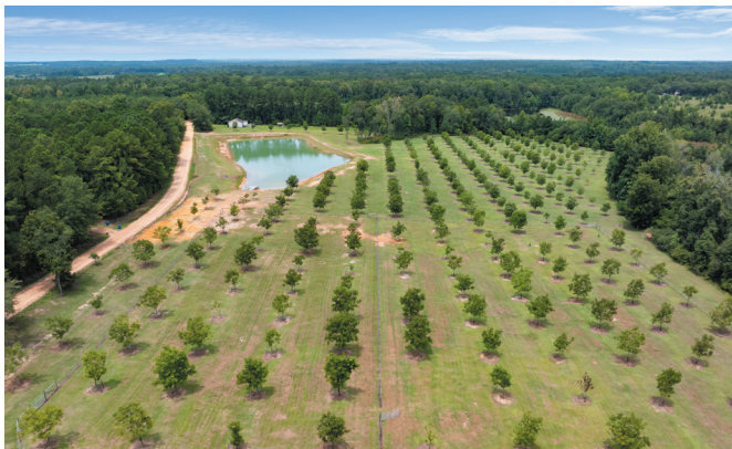
Orchard with pond view