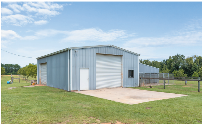
Workshop with dog kennel