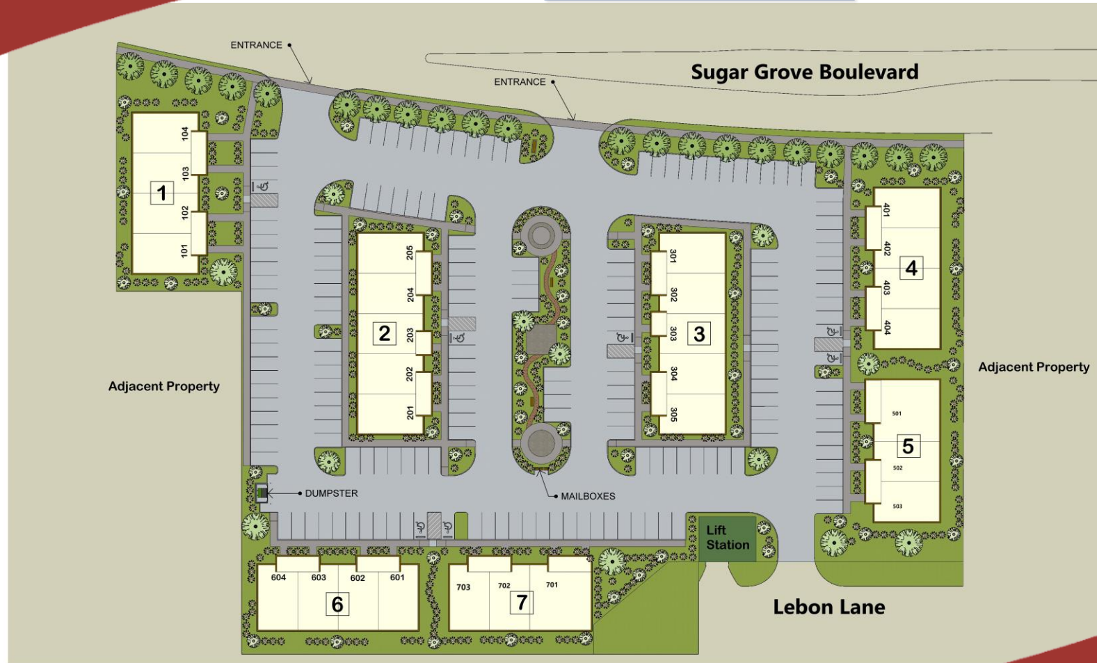
Sugar Grove Office Condominiums