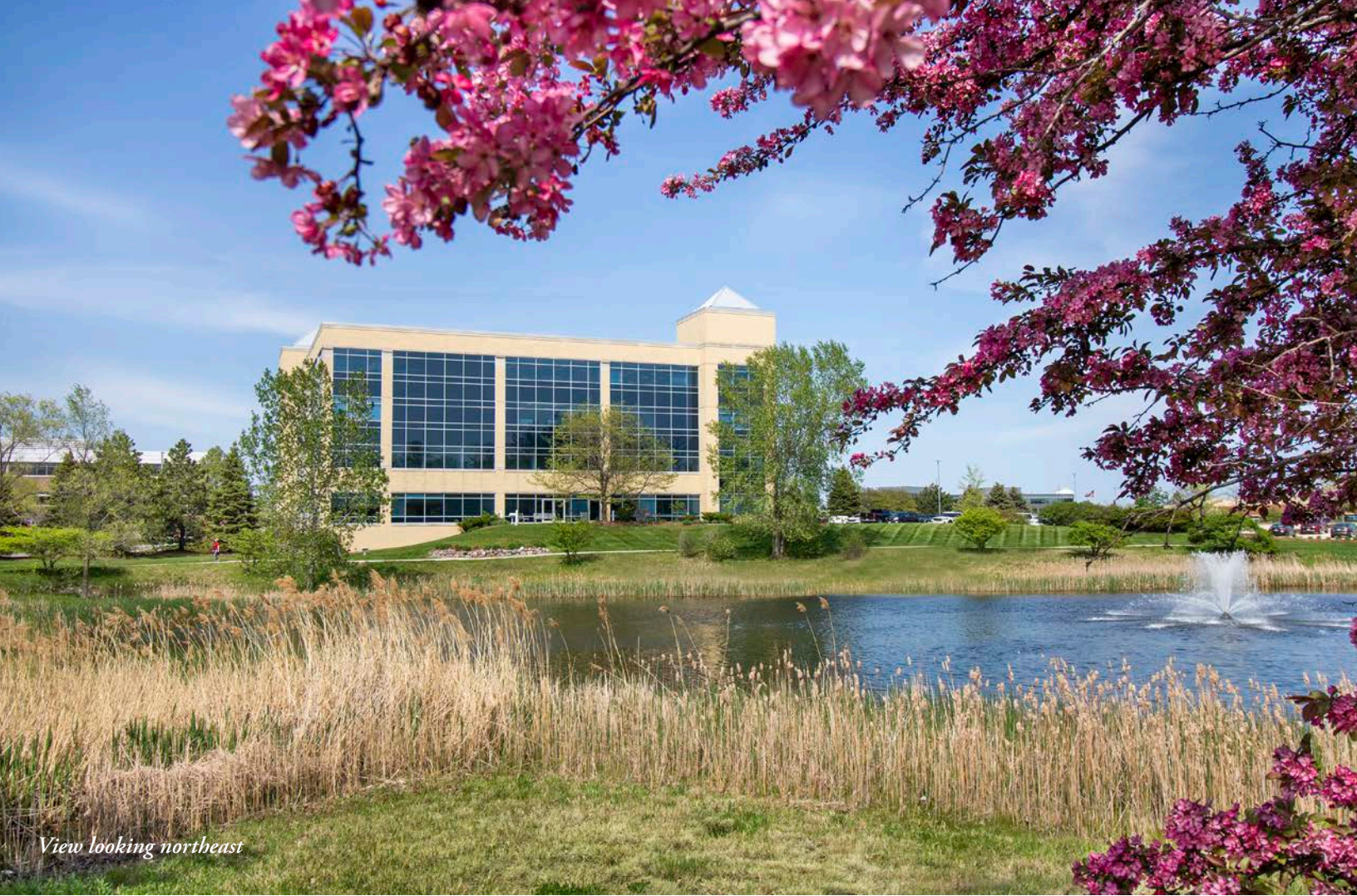
View looking northeast