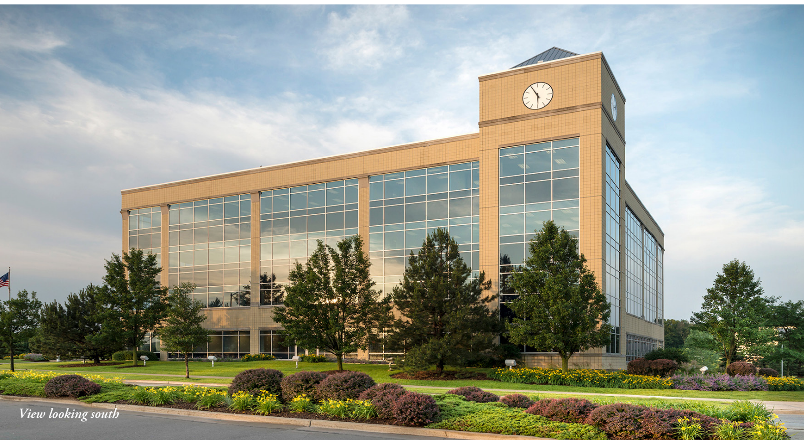
View looking south