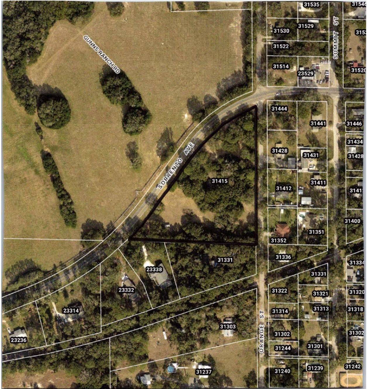
County GIS Aerial