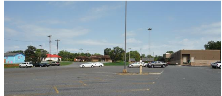
Ample on-site parking w/ LED lighting