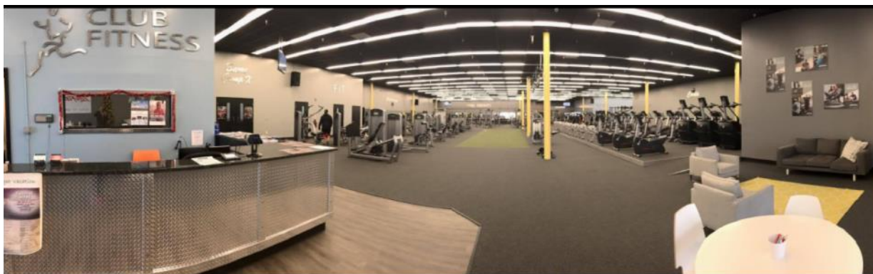
Club Fitness Interior