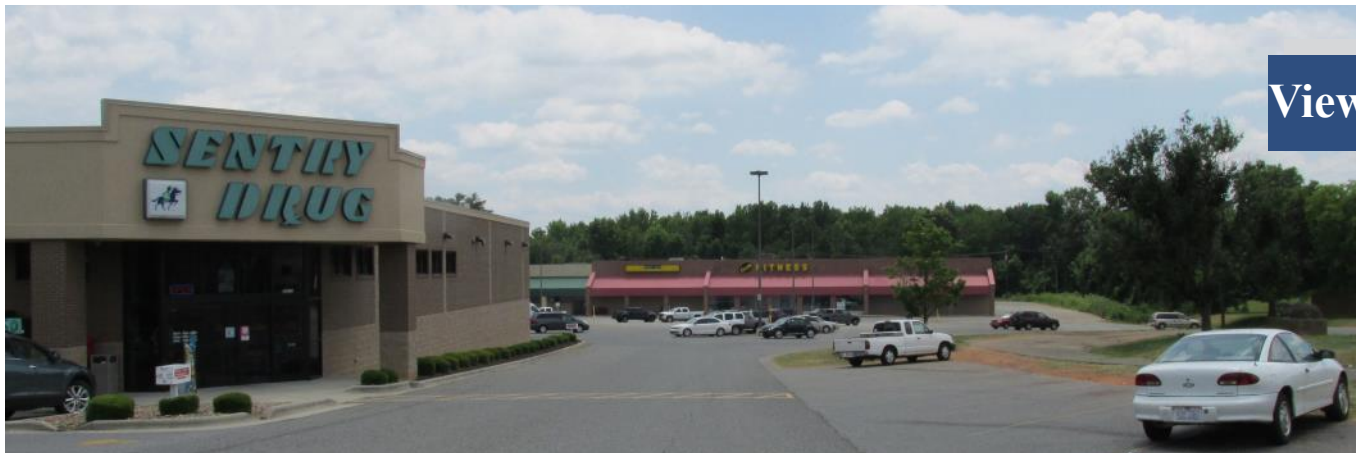
View from E. Main Street