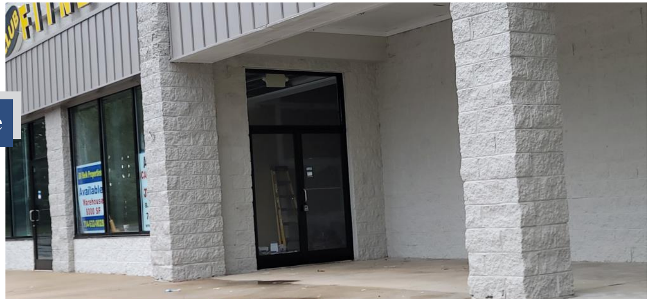
Front entrance to the space