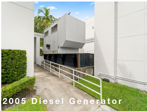
2005 Diesel Generator