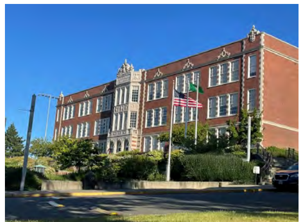
Garfield High School Established 1920