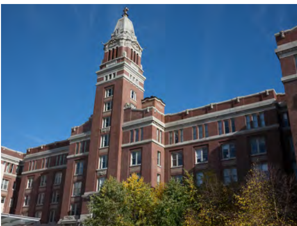
Swedish Medical Center Cherry Hill Campus