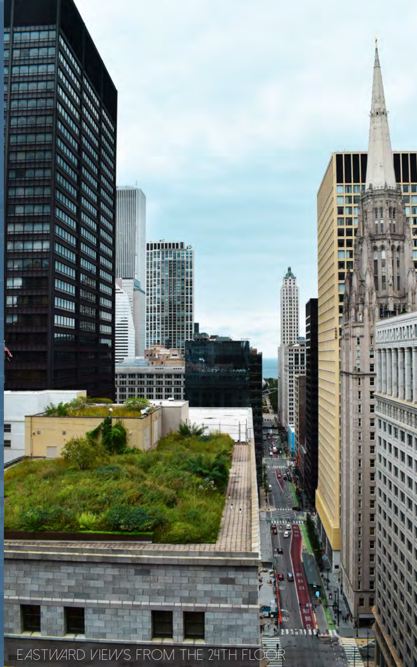
EASTWARD VIEWS FROM THE 24TH FLOOR