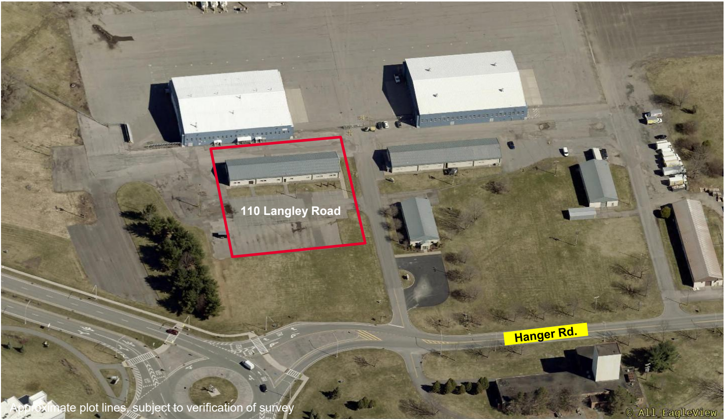
Approximate plot lines, subject to verification of survey