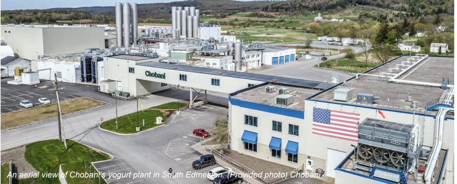
An aerial view of Chobani's yogurt plant in South Edmeston.

Chobani to invest $1.2 billion into building a 1.4 million square-foot dairy processing plant at Griffiss Business and Technology Park — the largest investment in natural food manufacturing in the United States. The Triangle Site, measuring around 332 acres at Griffiss International Airport, will house the new Greek yogurt manufacturing facility. Chobani aims to create more than 1,000 jobs in Oneida County, nearly doubling Chobani's New York State workforce.