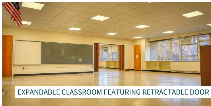
EXPANDABLE CLASSROOM FEATURING RETRACTABLE DOOR