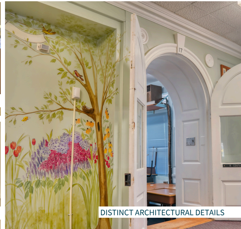
DISTINCT ARCHITECTURAL DETAILS