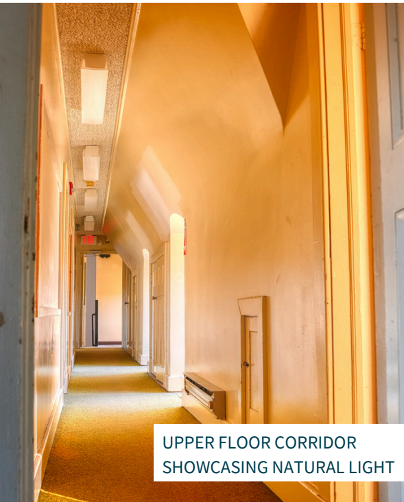
UPPER FLOOR CORRIDOR SHOWCASING NATURAL LIGHT