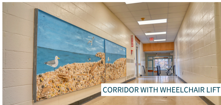
CORRIDOR WITH WHEELCHAIR LIFT