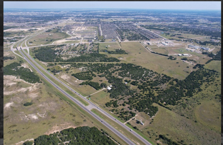
Image 9. Aerial view of the property from State Highway 195 (SH-195) facing north