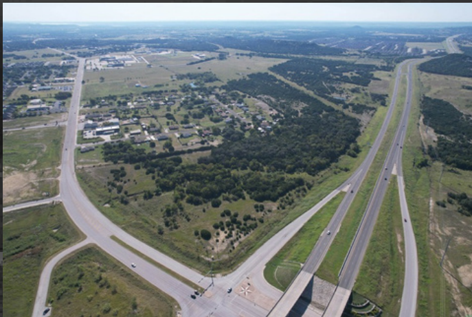
Image 8. Aerial view of the property from the intersection of State Highway 195 (SH-195) and State Highway 201 (SH-201) facing southeast