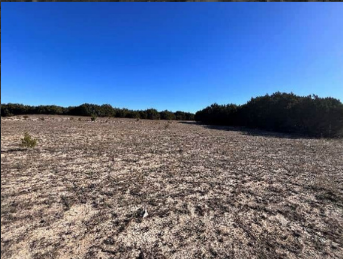
Image 10. General Site Conditions