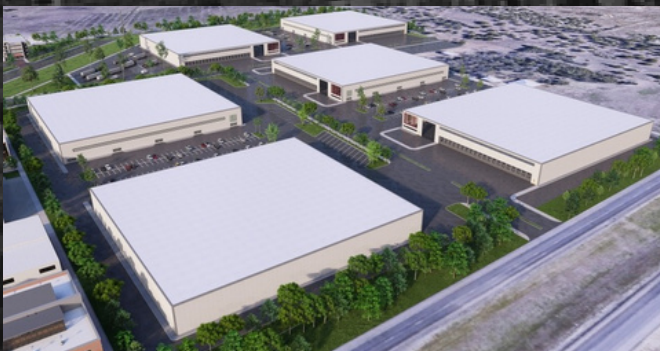
Image 4. Wolf Technology Park Masterplan Rendering