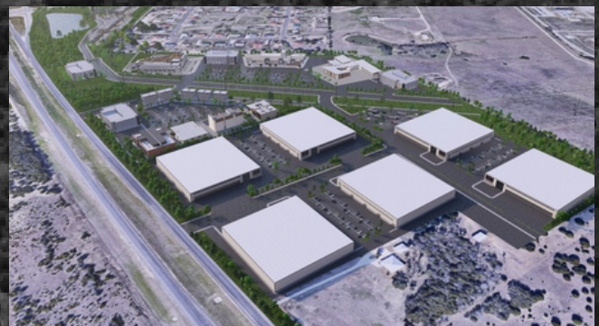
Image 5. Wolf Technology Park Masterplan Rendering