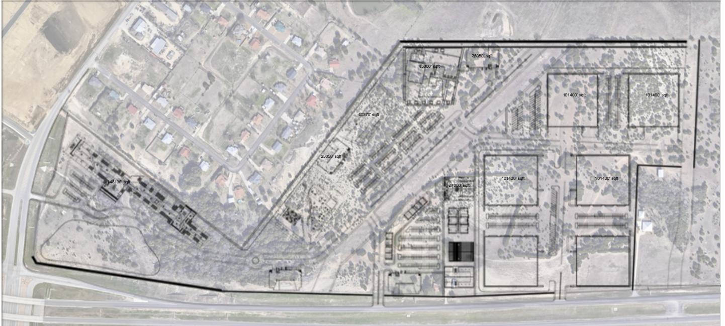
Image 1. Wolf Technology Park Pad Site Layout Plan