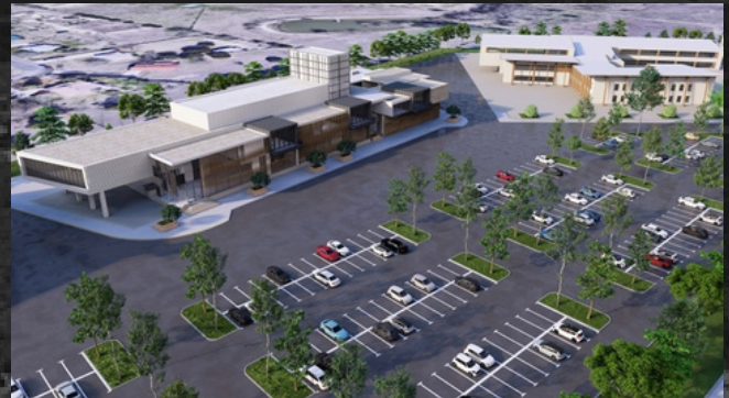
Image 3. Wolf Technology Park Masterplan Rendering