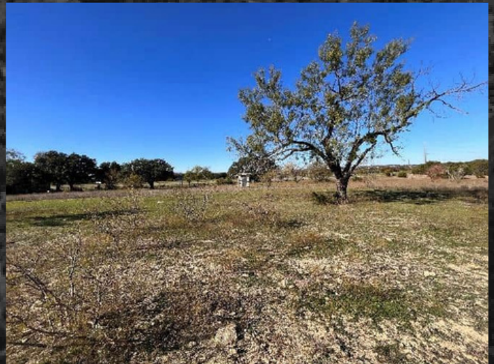
Image 11. General Site Conditions