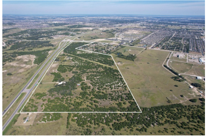
Image 7. Aerial view and outline of the property from State Highway 195 (SH-195) facing northwest