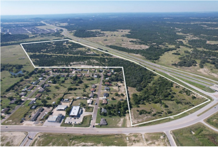
Image 6. Aerial view and outline of the property from Stagecoach Road facing south

8388 State Highway 195 (Wolf Technology Park) Killeen, Texas 76540