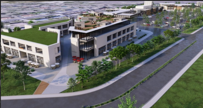
Image 2. Wolf Technology Park Masterplan Rendering