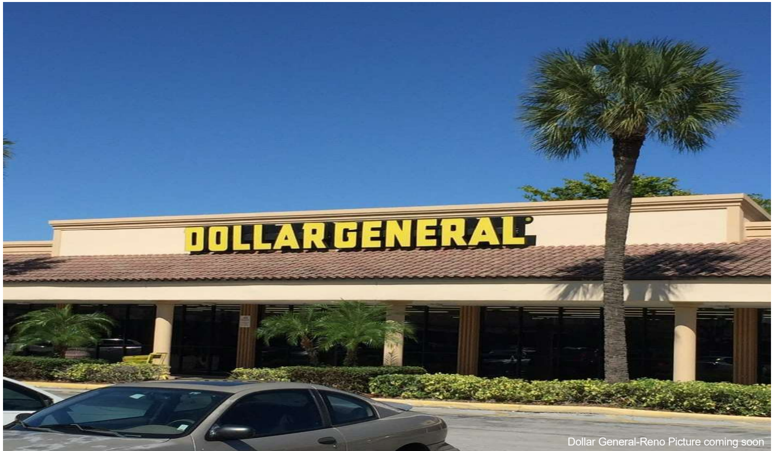
Dollar General-Reno Picture coming soon