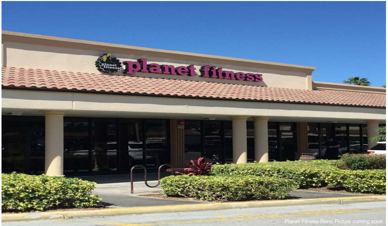
Planet Fitness-Reno Picture coming soon