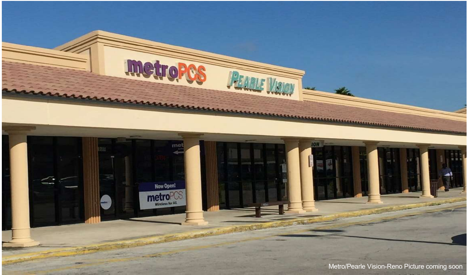
Metro/Pearle Vision-Reno Picture coming soon