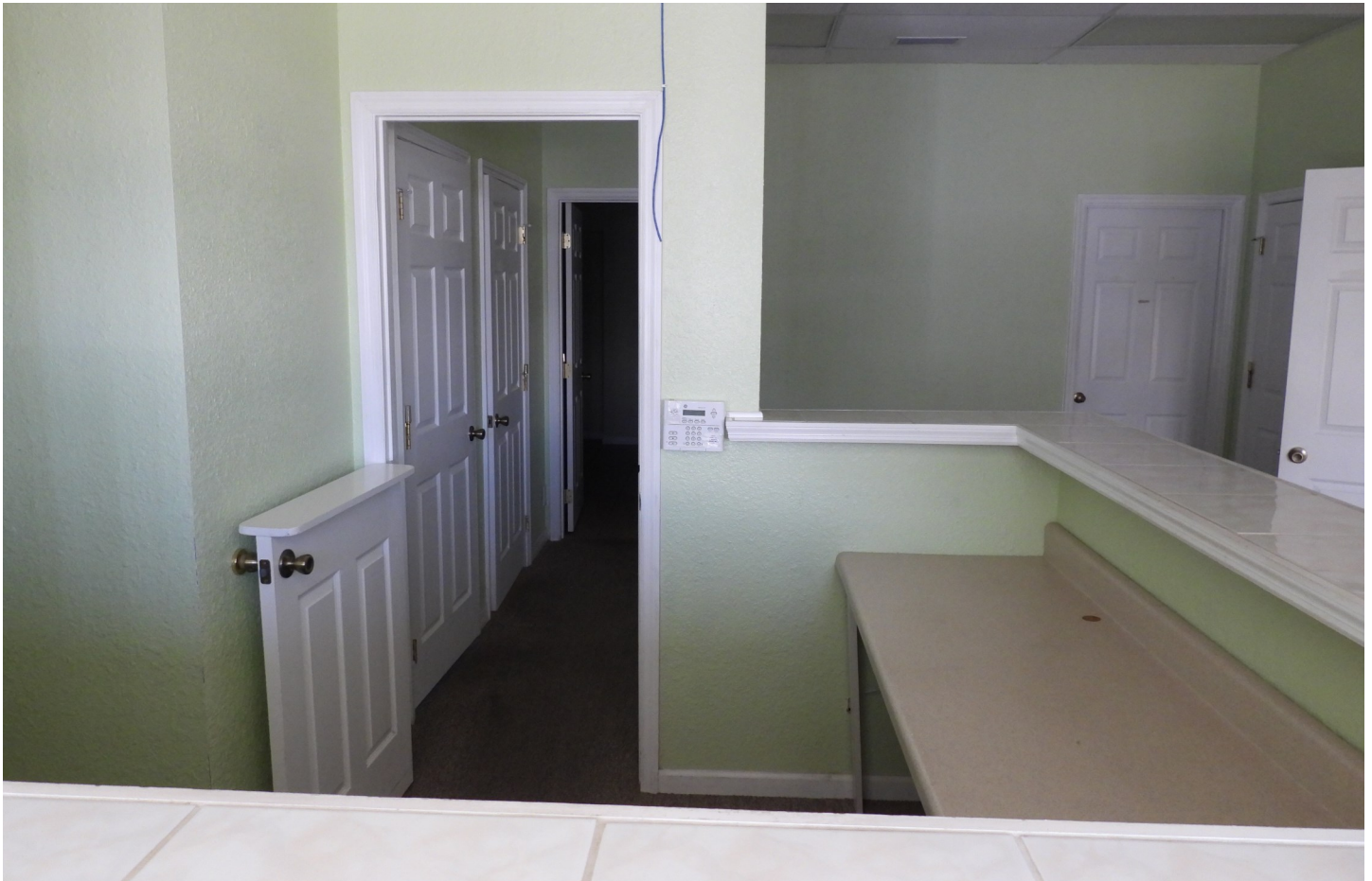
Suite 105 - Former Medical Clinic

503 N Orlando Ave, Cocoa Beach, FL 32931