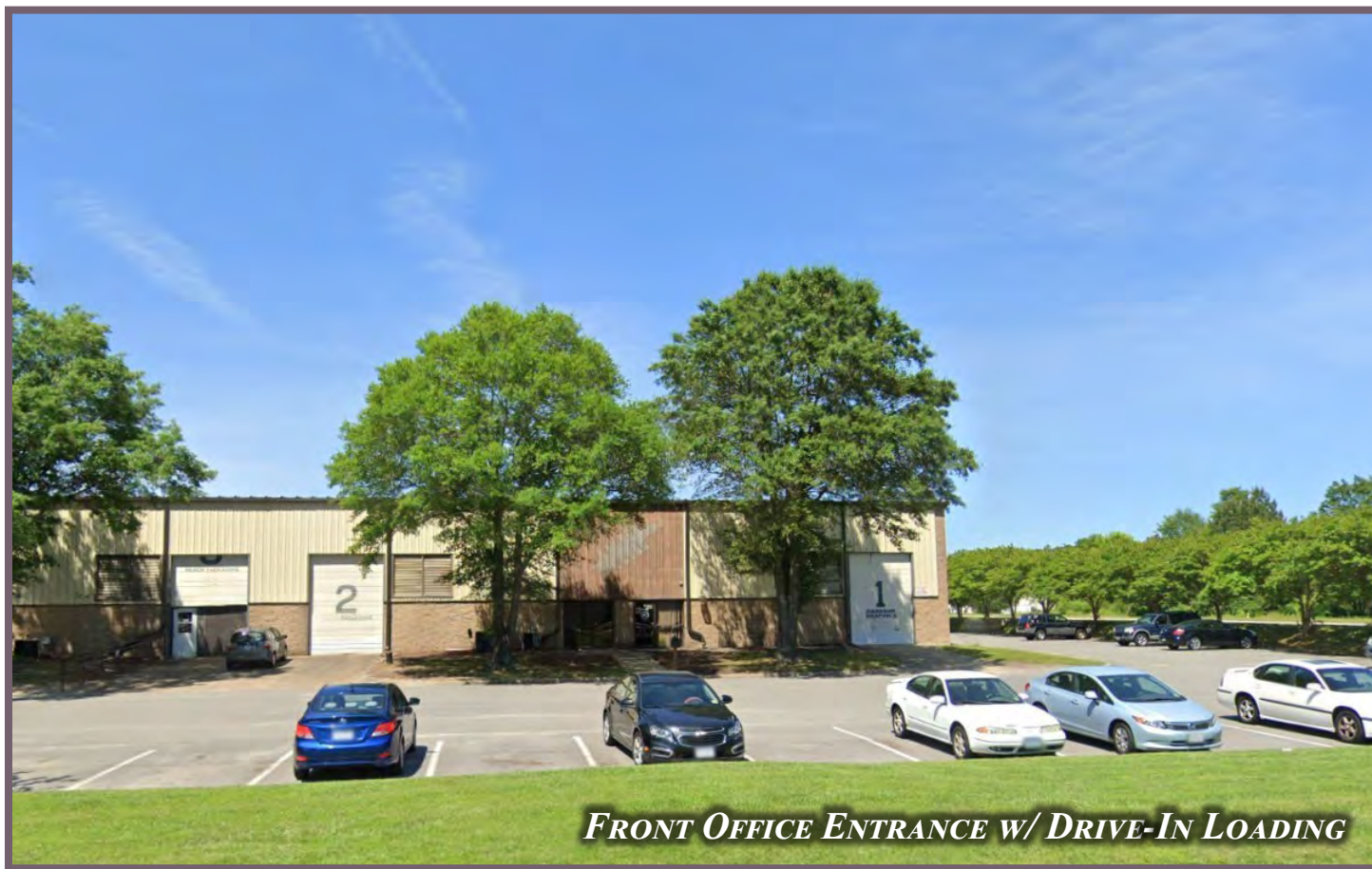
FRONT OFFICE ENTRANCE W/ DRIVE-IN LOADING