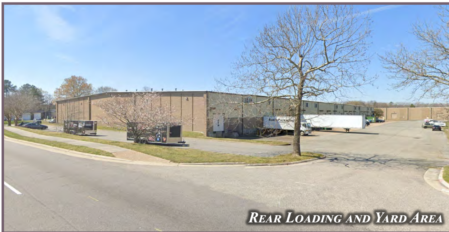
REAR LOADING AND YARD AREA