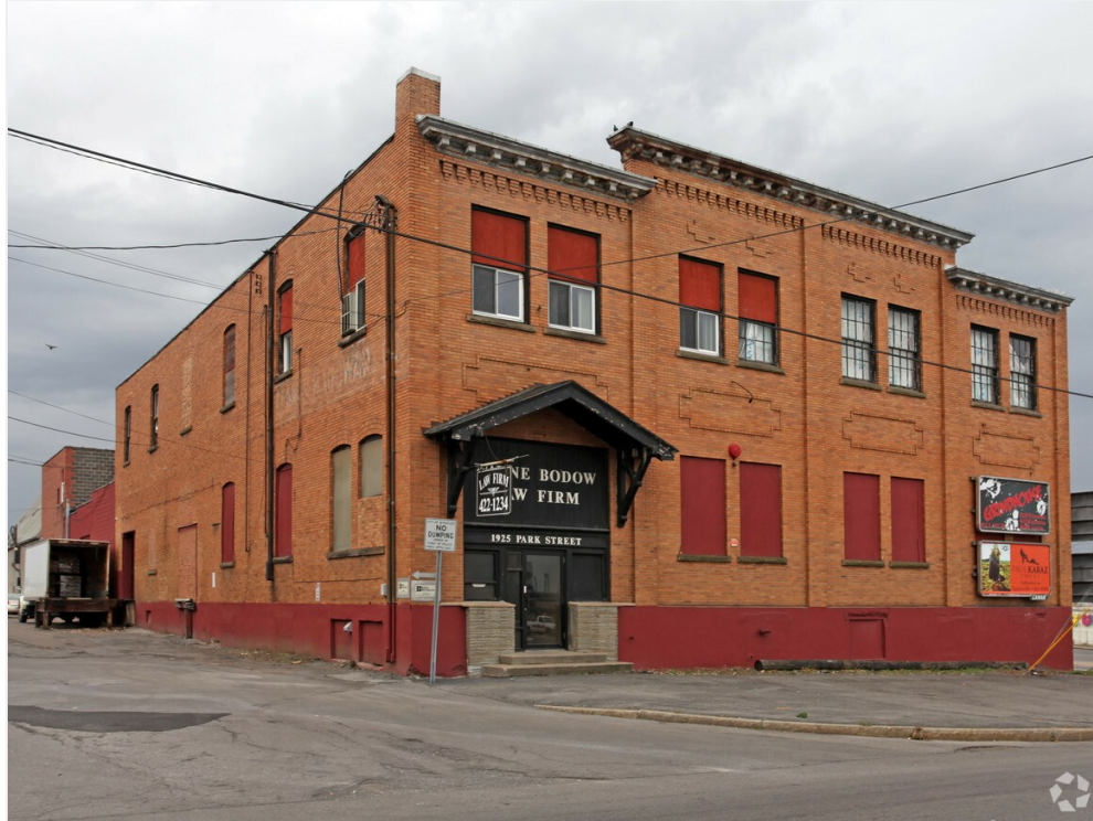
1925 Park St