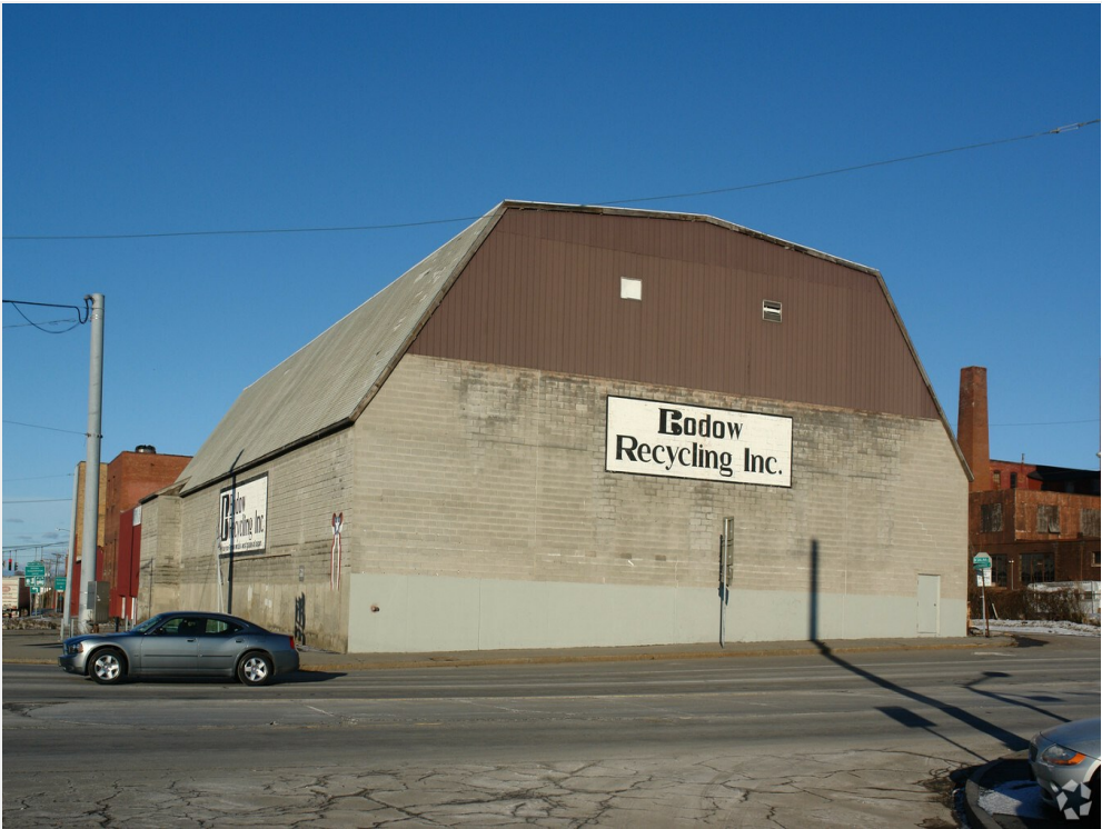
1800 N Salina St