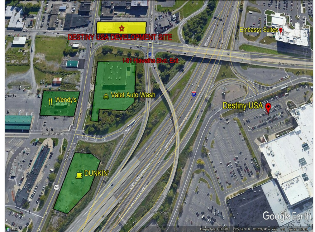
Destiny USA Development Site