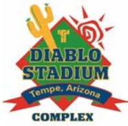
Diablo Stadium Complex