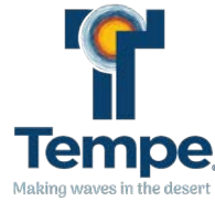
Tempe Beach Park