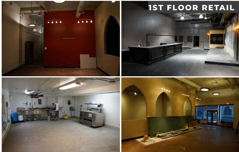
1ST FLOOR RETAIL