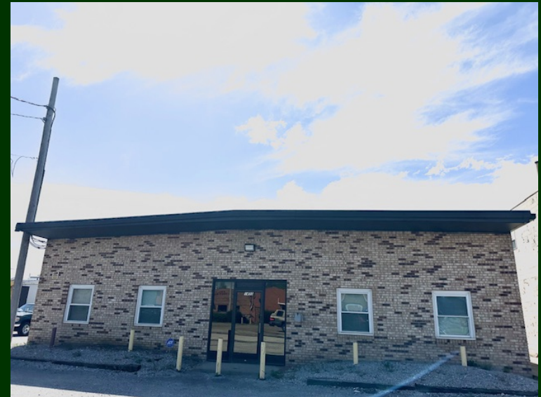
1450 E. 357th St., Eastlake, OH 44095

No warranty or representation, express or implied, is made as to the accuracy of the information contained herein. It is submitted subject to errors, omissions, price changes, rental or other conditions, withdrawal without notice, and to any special listing conditions imposed by our client.