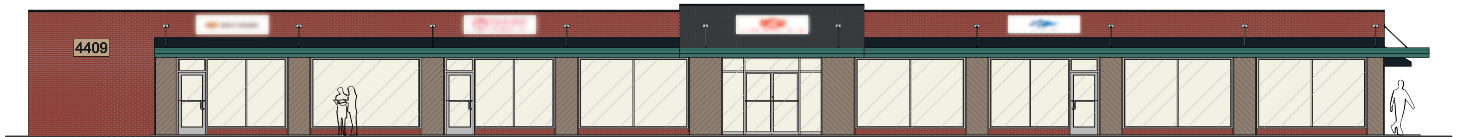
PRELIMINARY EAST MAIN STREET ELEVATION (NORTH)