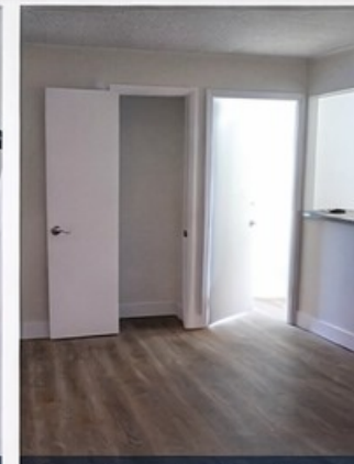
Additional Office Space