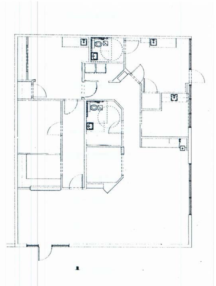
Suite 900 - 2,085 rsf