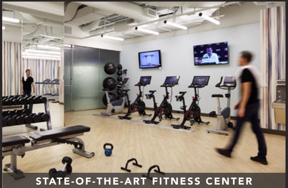
STATE-OF-THE-ART FITNESS CENTER