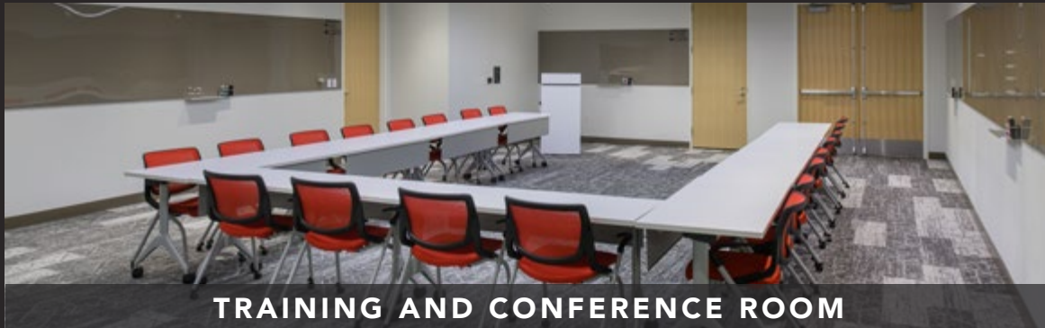
TRAINING AND CONFERENCE ROOM