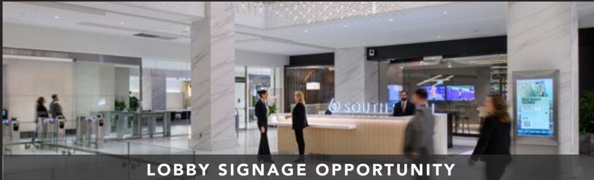
LOBBY SIGNAGE OPPORTUNITY