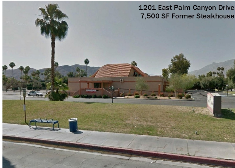
1201 East Palm Canyon Drive 7,500 SF Former Steakhouse