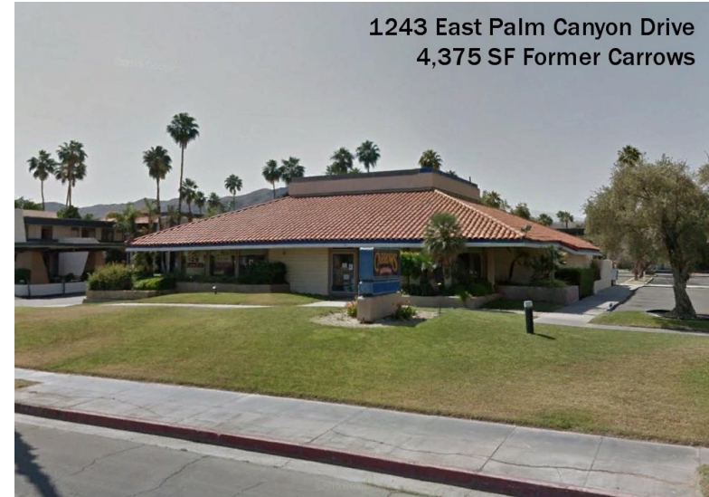
1243 East Palm Canyon Drive 4,375 SF Former Carwos