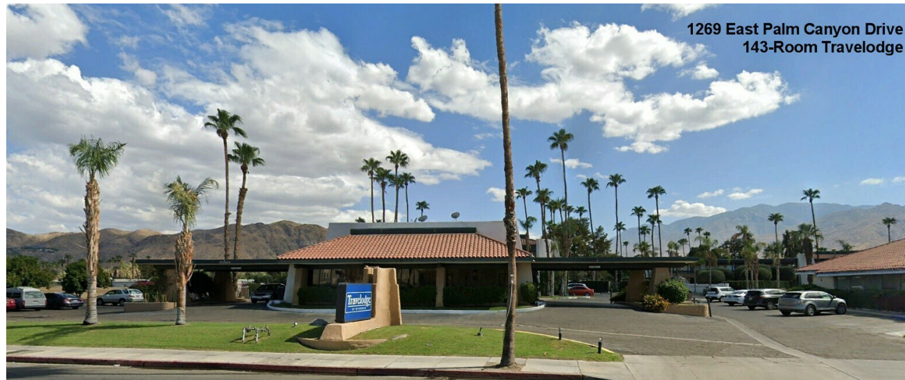
1269 East Palm Canyon Drive 143-Room Travelodge

Michael Lyle 760.774.6533 CalDRE #02002995 mlyle@cbclyle.net