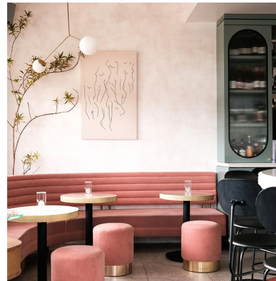
JEUNE ET JOLIE