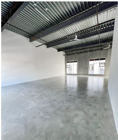
UNIT 104 2ND FLOOR