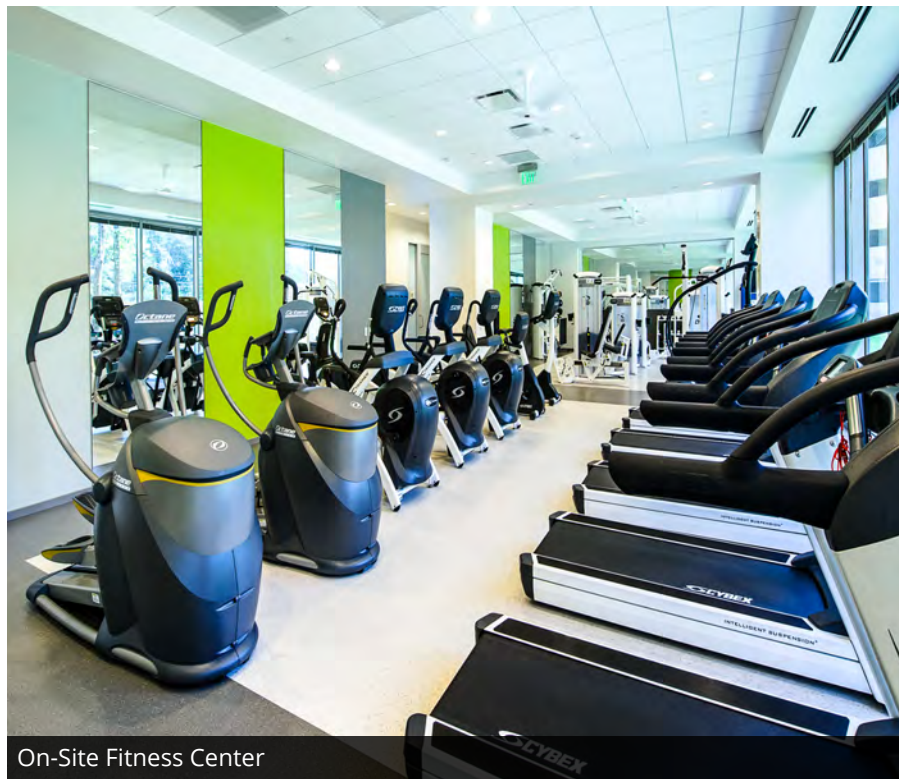
On-Site Fitness Center