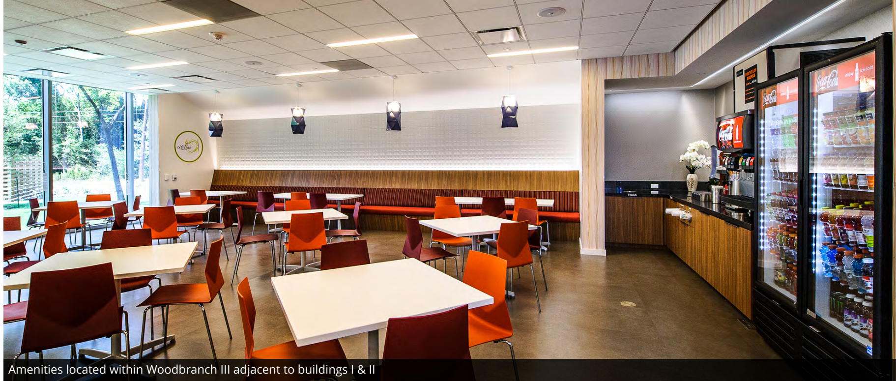
Amenities located within Woodbranch III adjacent to buildings I & II