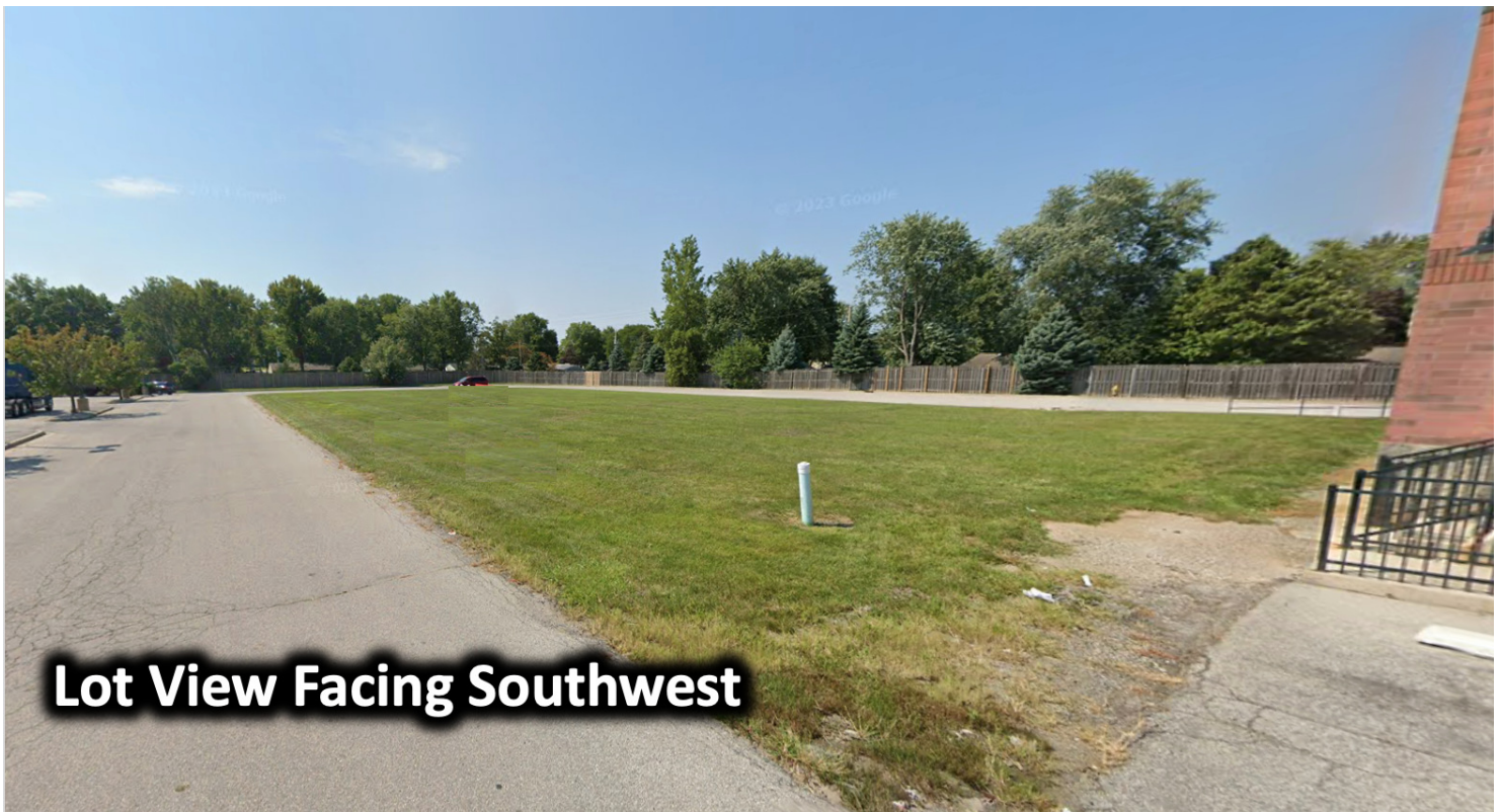
Lot View Facing Southwest