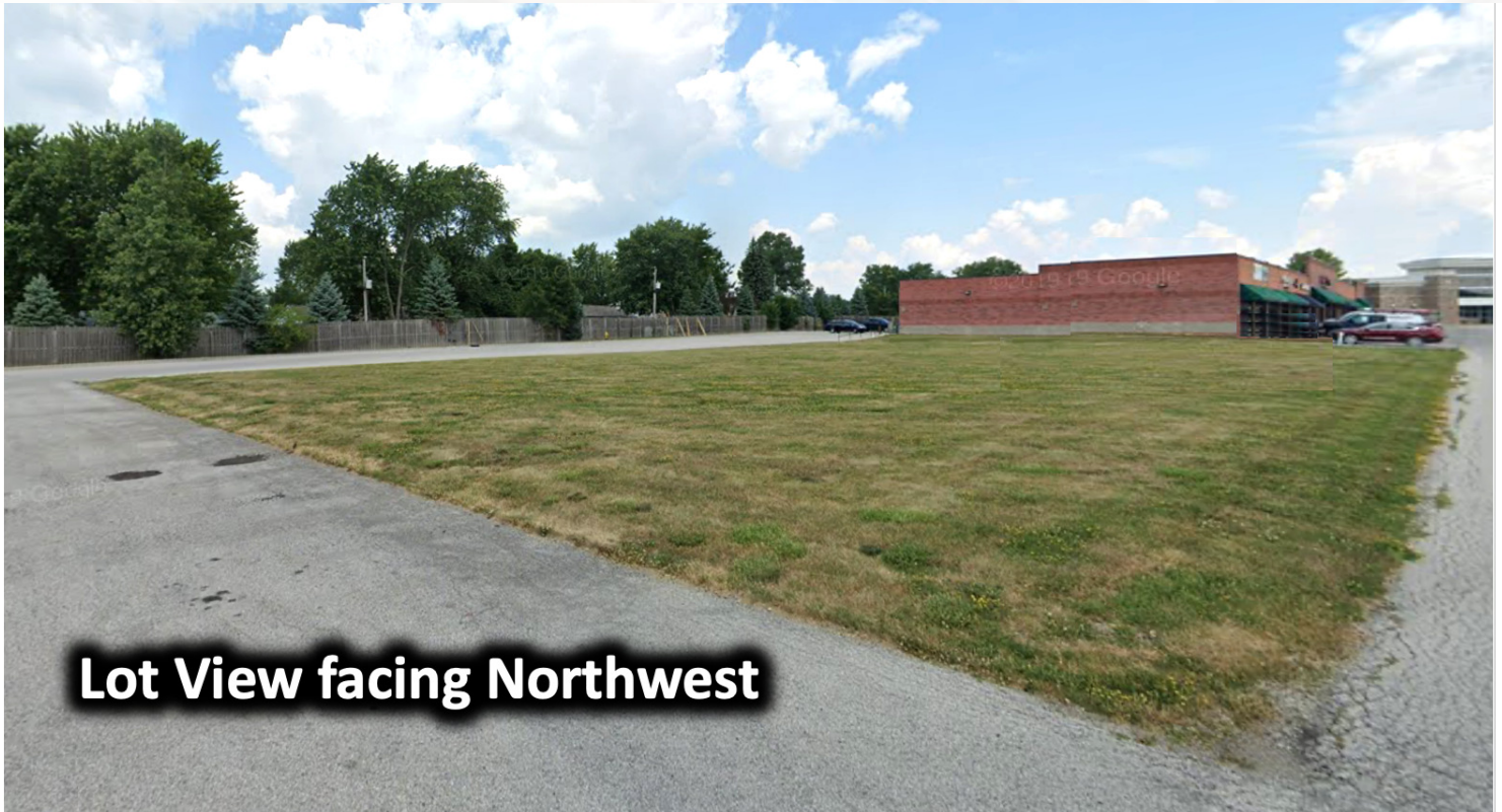
Lot View facing Northwest

7221 MAPLECREST RD, FORT WAYNE, IN 46835