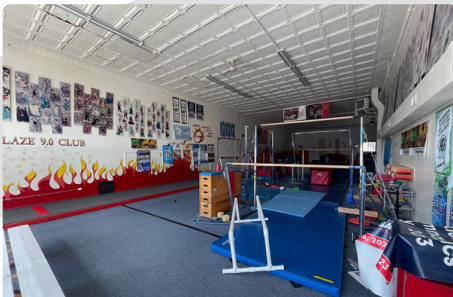
BEAUTIFUL NATURAL LIGHT