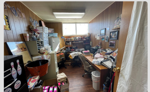
SEVERAL SMALL OFFICE AREAS