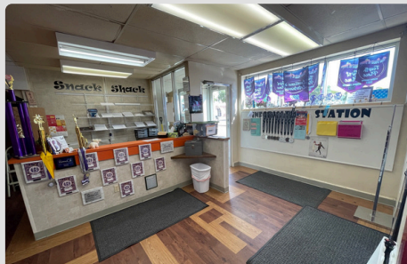
FRONT ROOM LOBBY