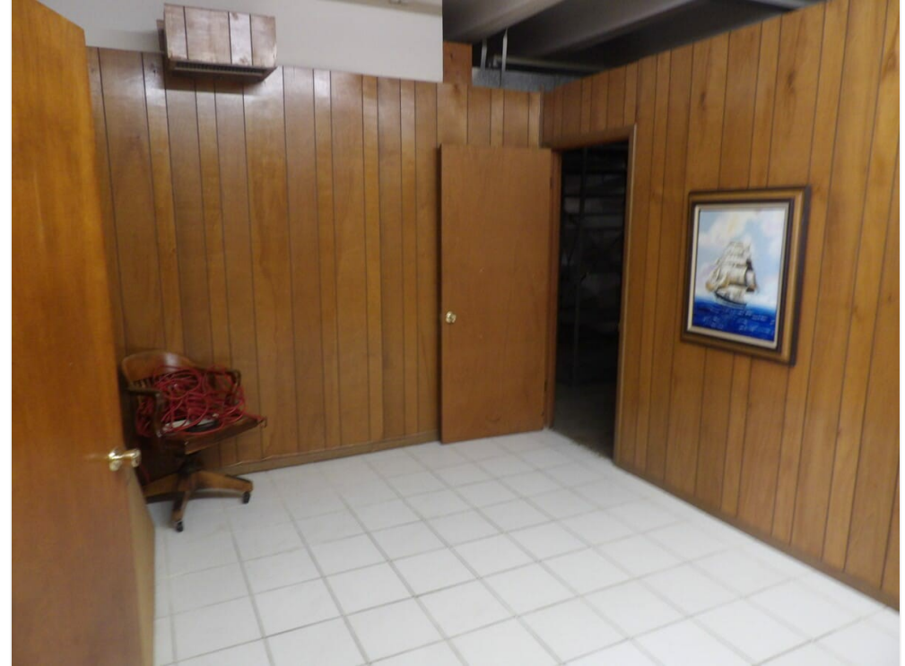
Office 1812 Wayside