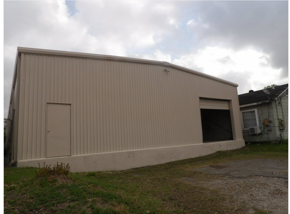
Warehouse View from Ave R