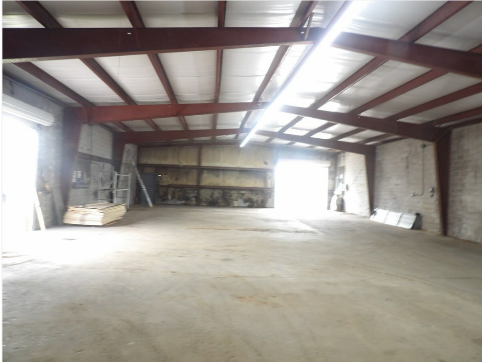
Warehouse on 6808 Ave S