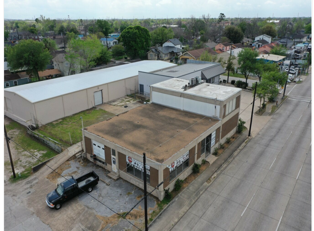
Aerial View of Warehouse and Showroom