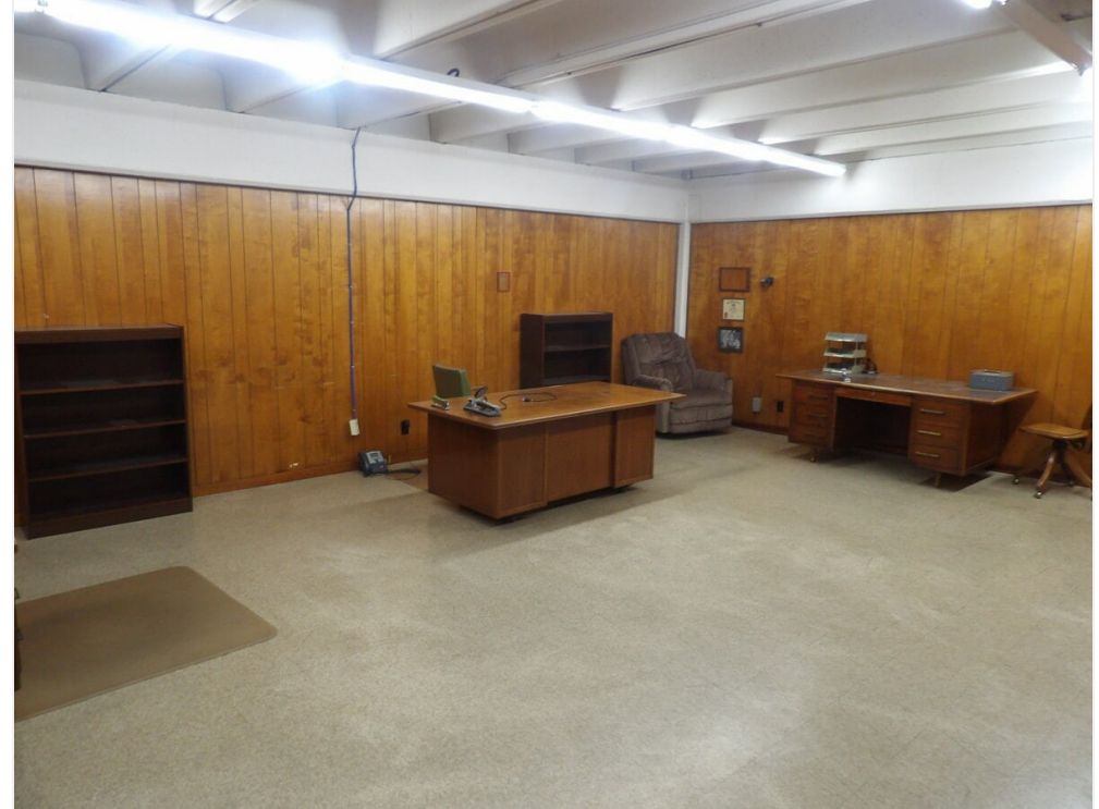
Upstairs Office 1812 Wayside