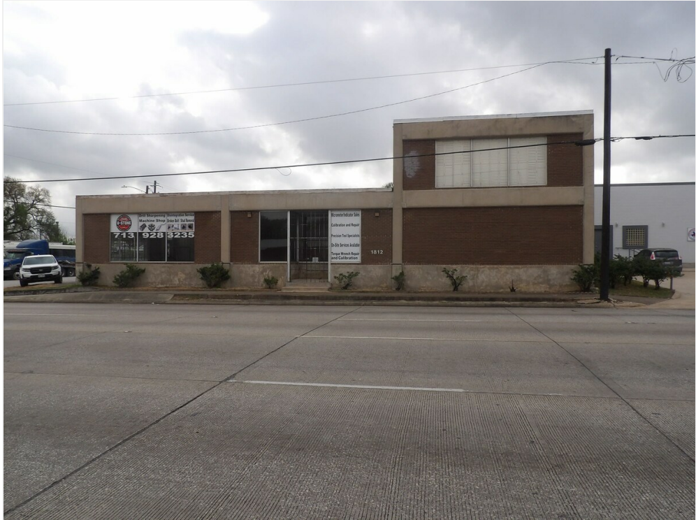
Front Elevation 1812 Wayside