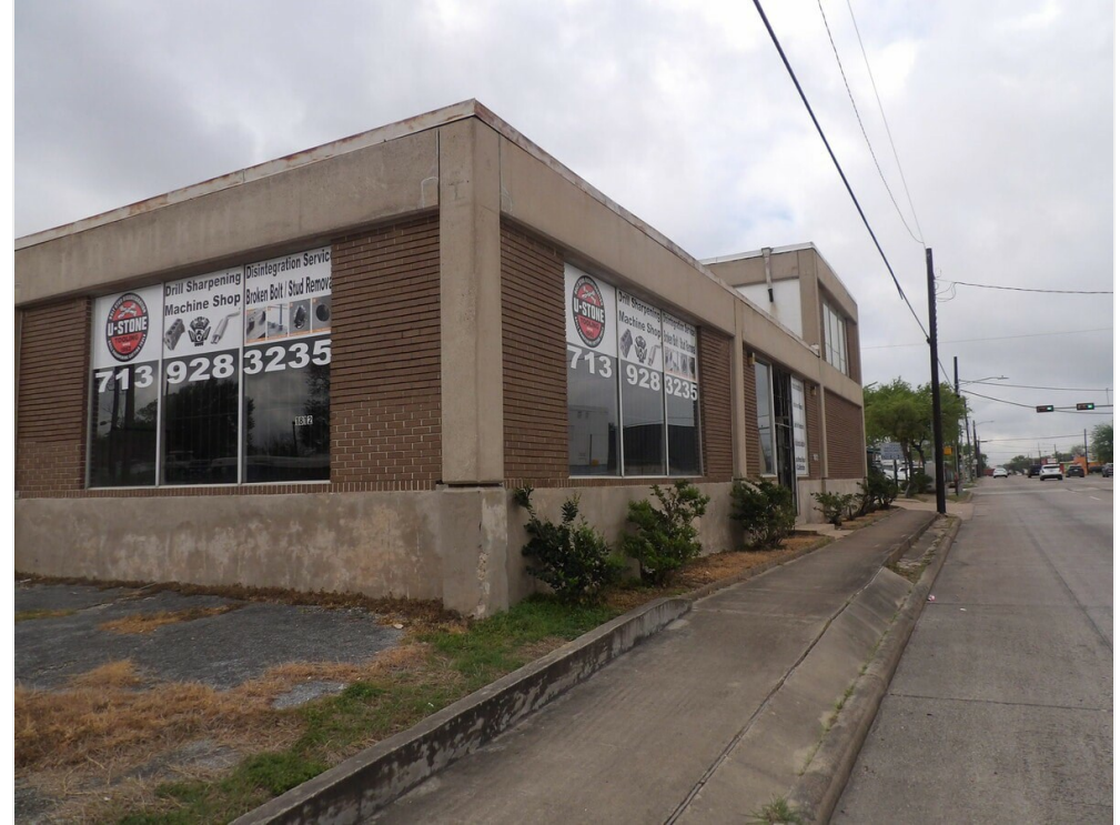
Side Elevation 1812 Wayside