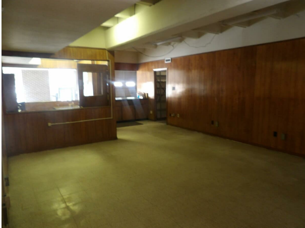
Receiving area 1812 Wayside