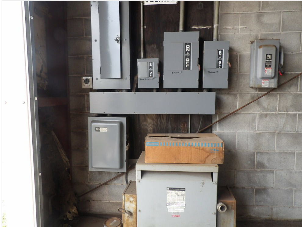
3 Phase Power