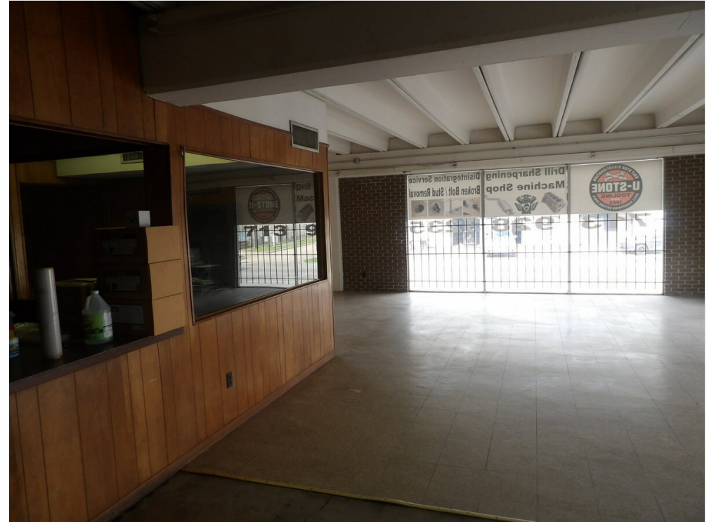
Showroom 1812 Wayside