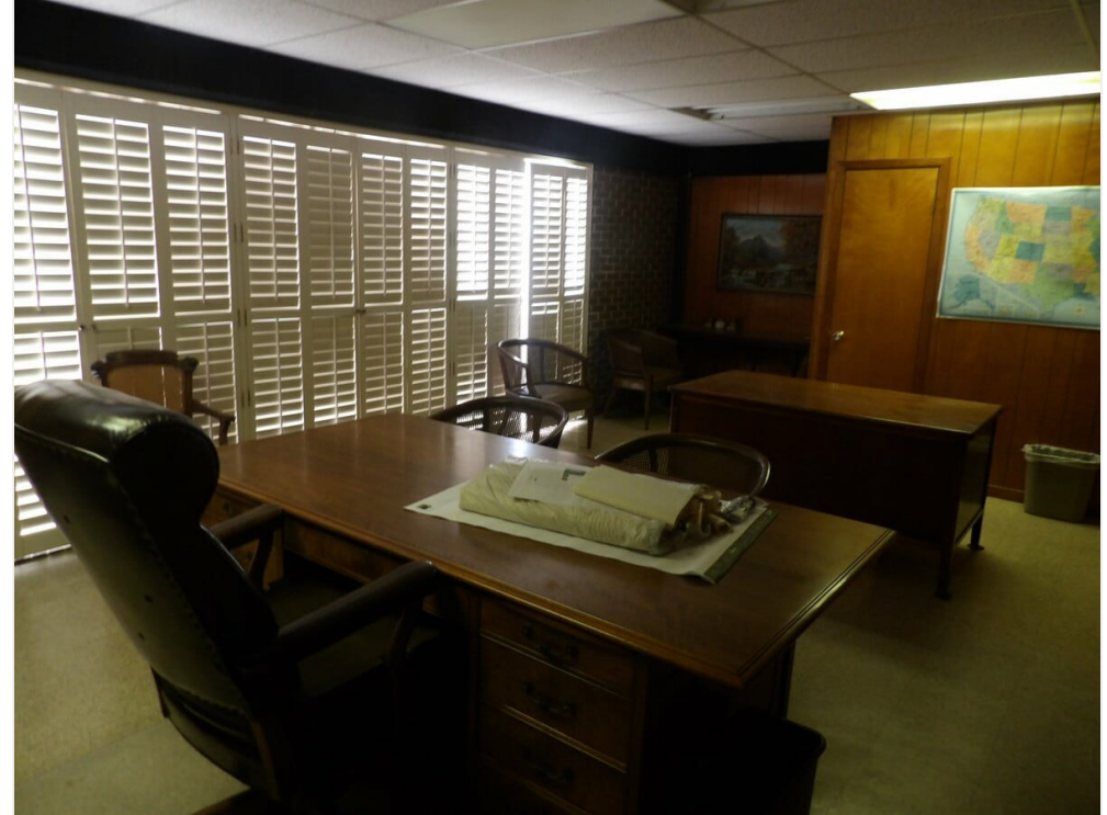
Upstairs Office (3) 1812 Wayside