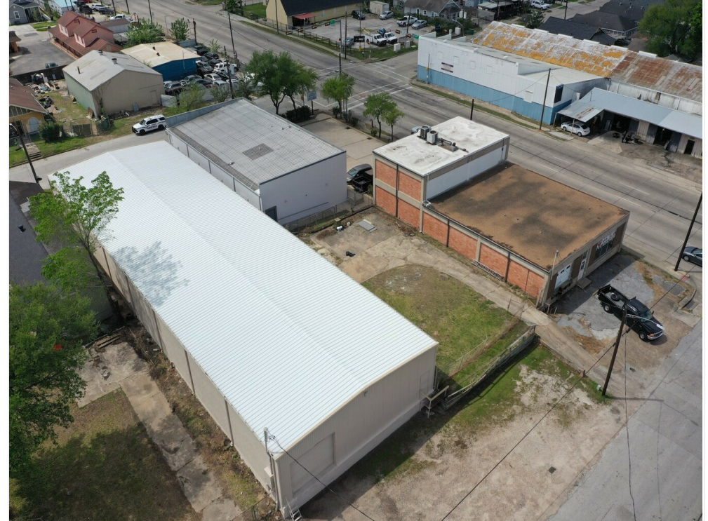
Aerial View of both buildings