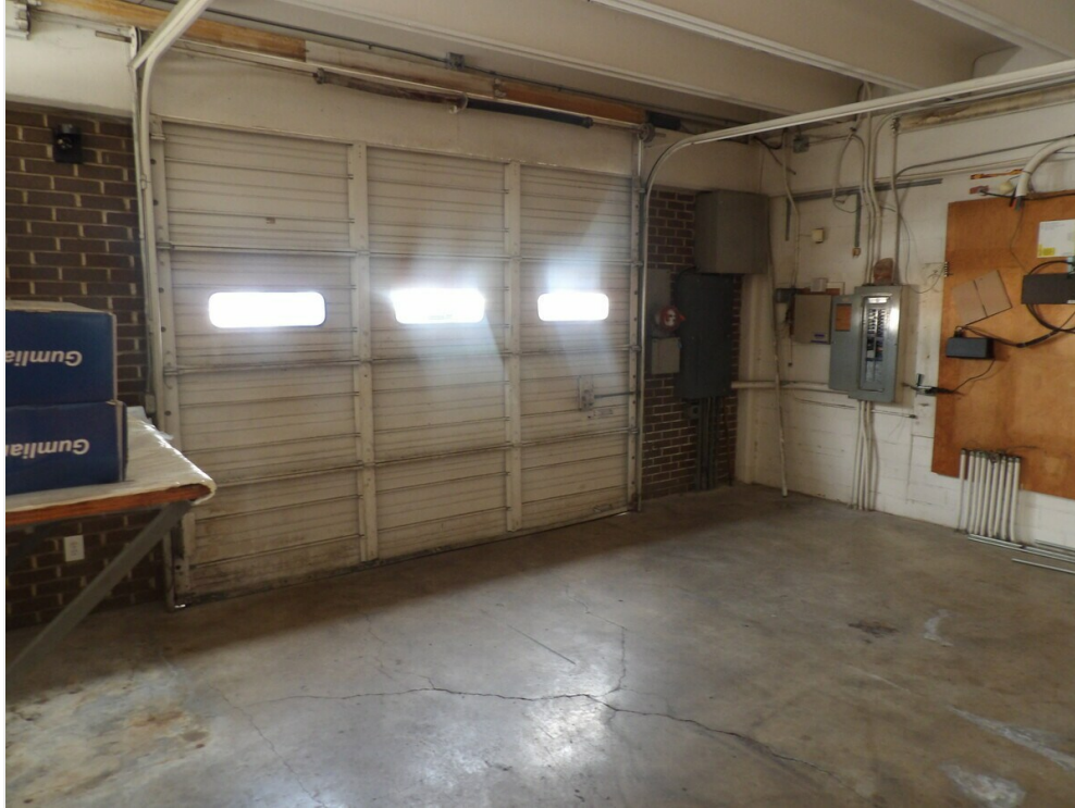
Interior Loading Dock 1812 Wayside