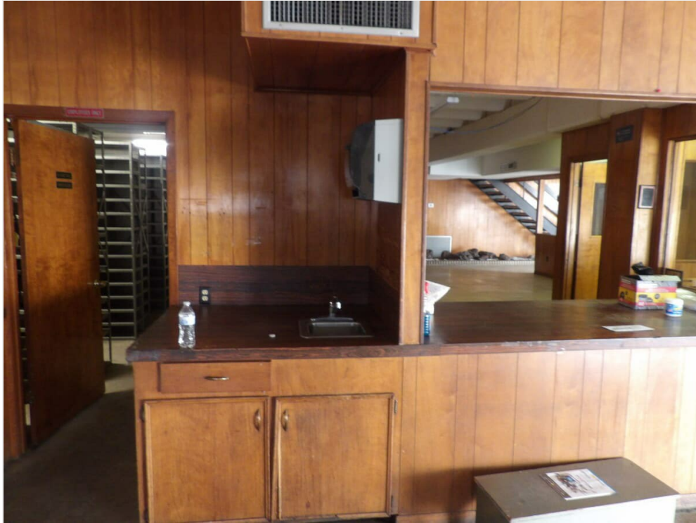
Front Counter 1812 Wayside