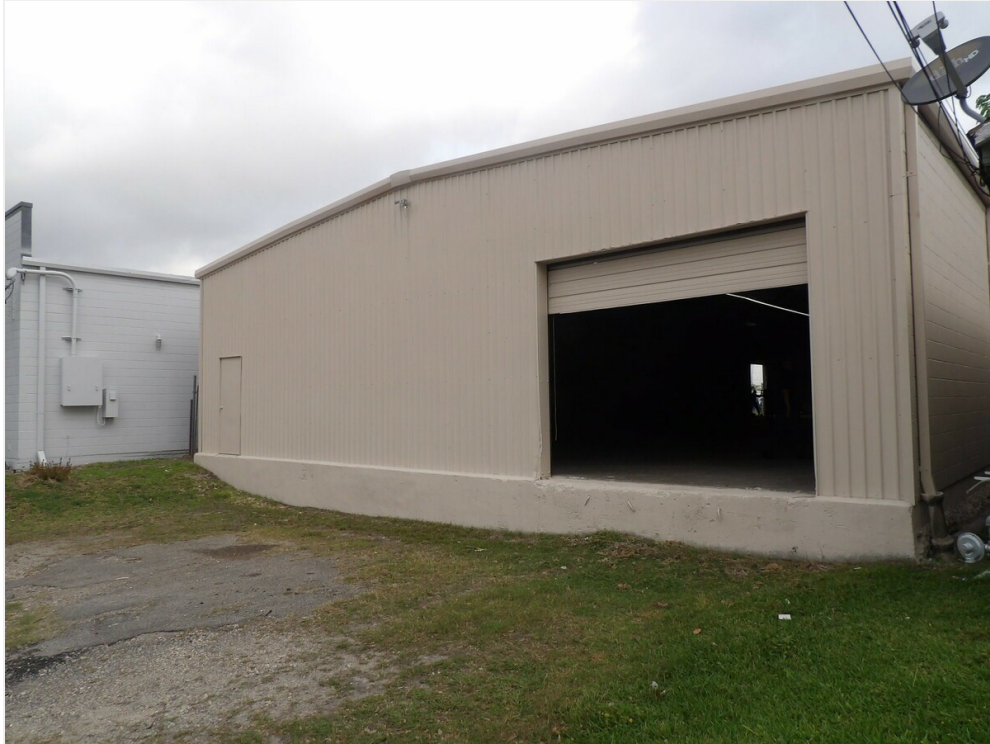
View from Ave R