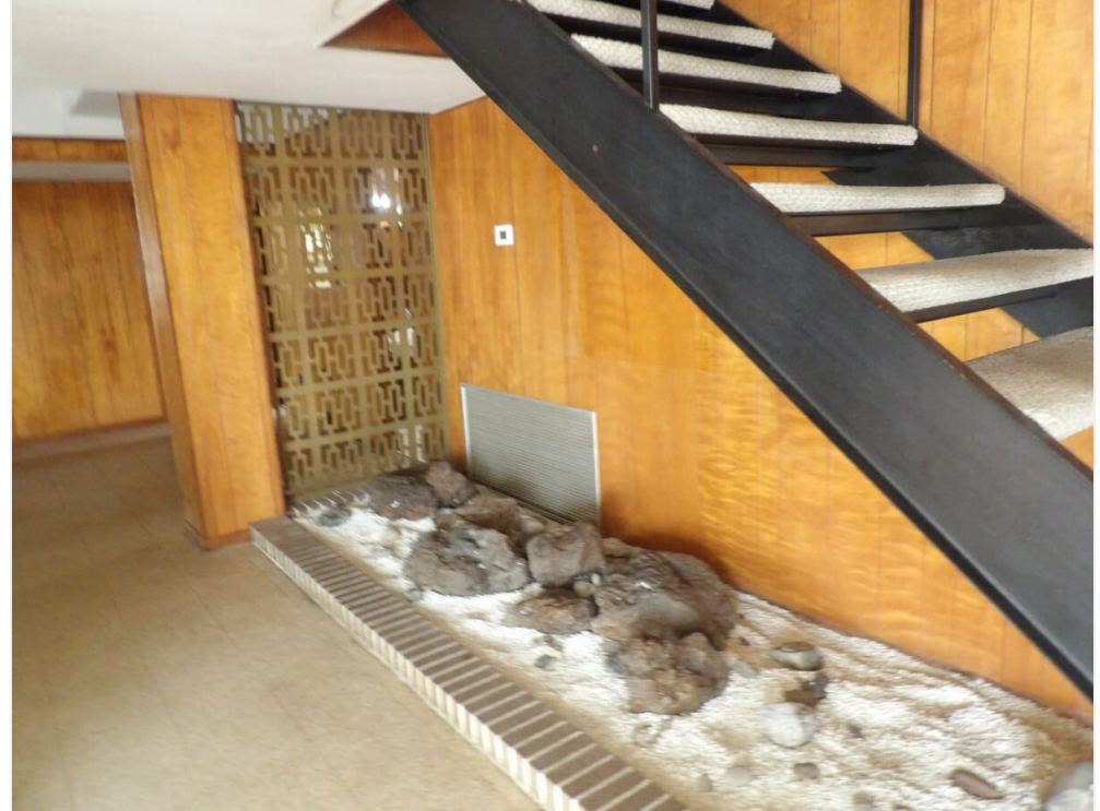
Atrium and Stairs to 2nd floor