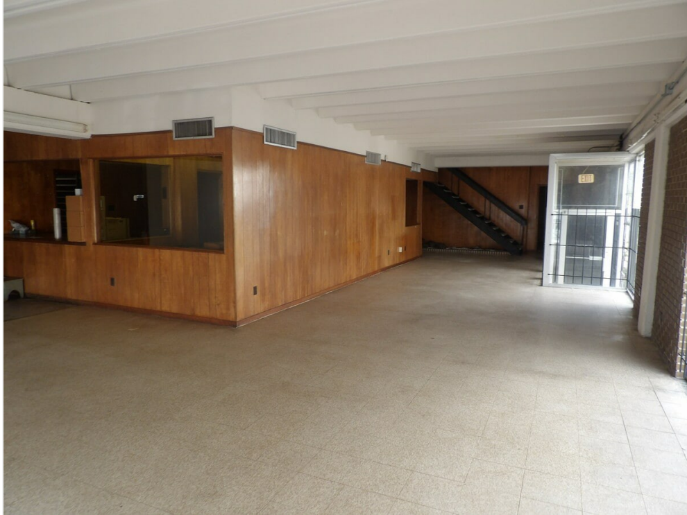
Showroom 1812 Wayside