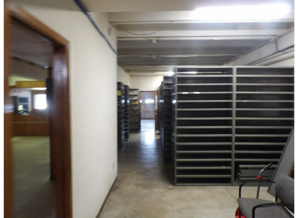
File Room 1812 Wayside