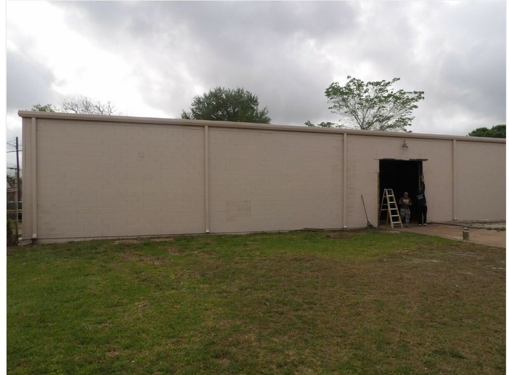
View from Center