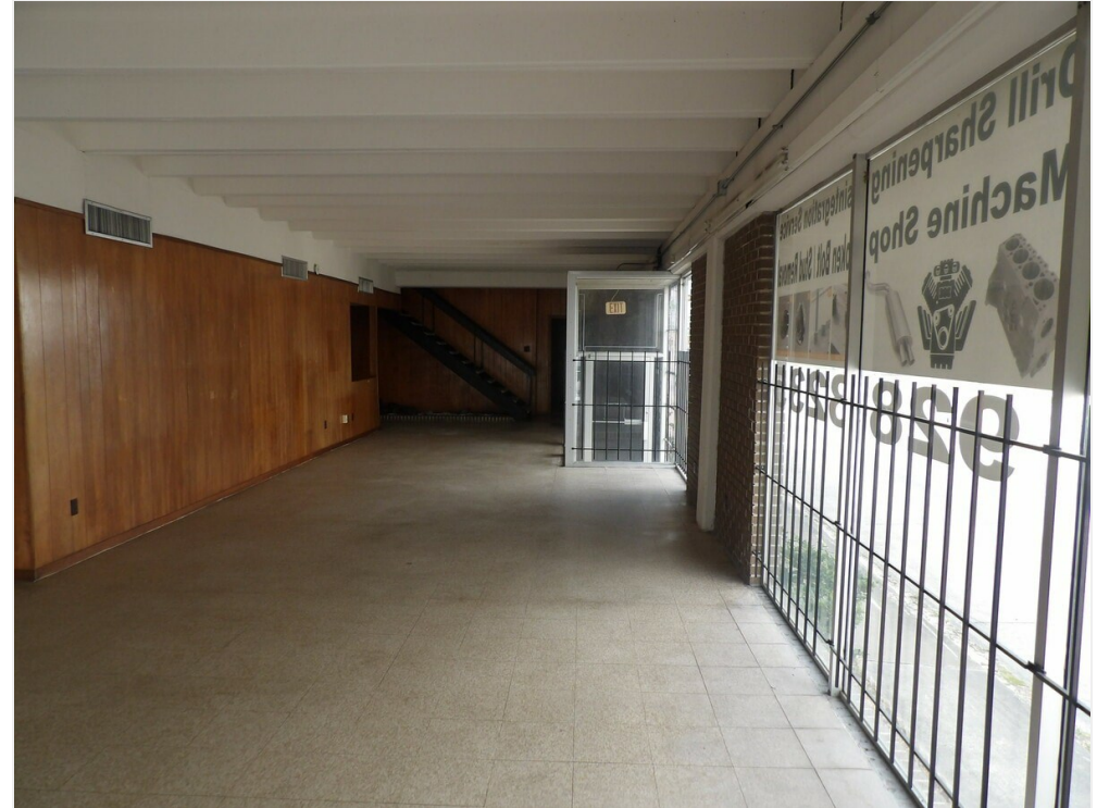
Showroom 1812 Wayside