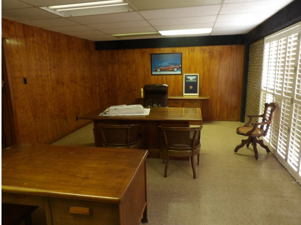
Other View office (3)