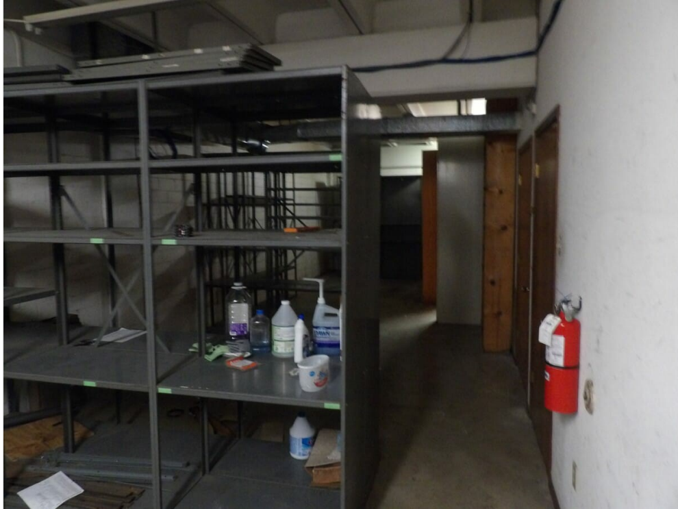
Storage Room 1812 Wayside