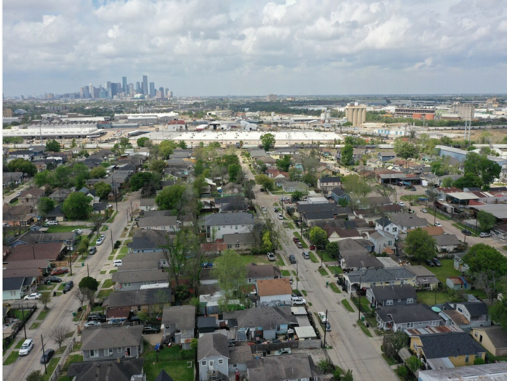
Aerial View of Downtown Houston