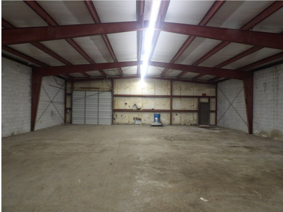
Warehouse on 6808 Ave S