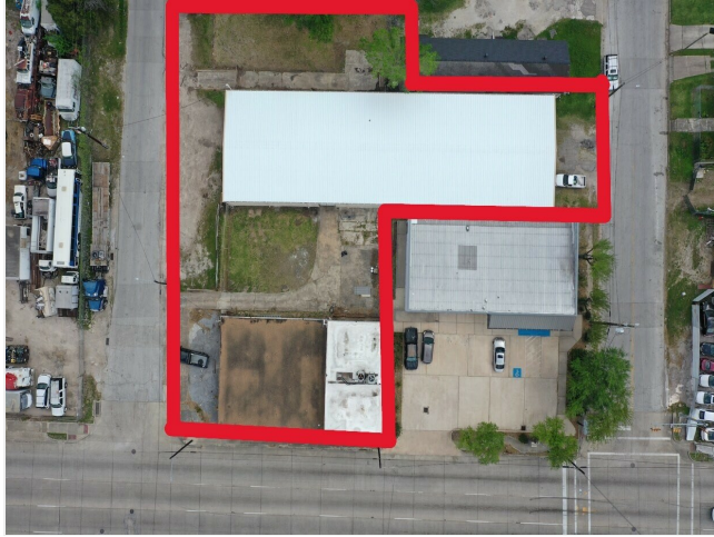
Aerial View (2)