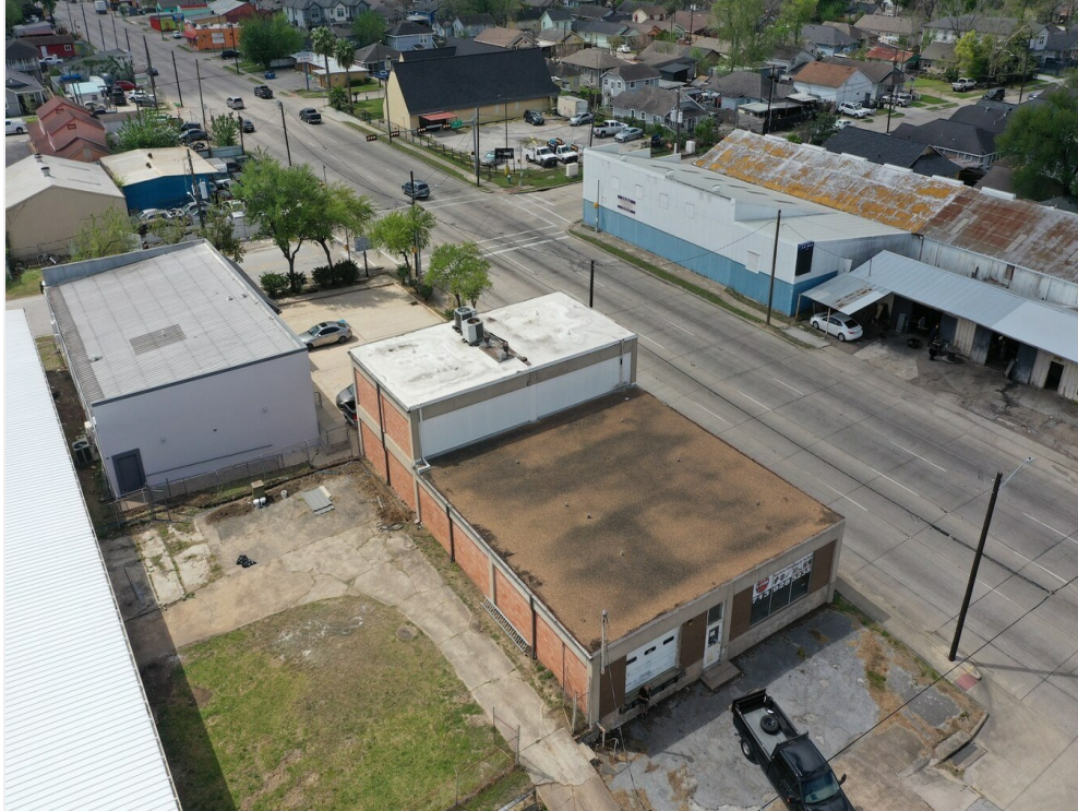
View of Office/Showroom Bldg