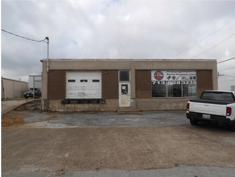
Ave S View of 1812 Wayside