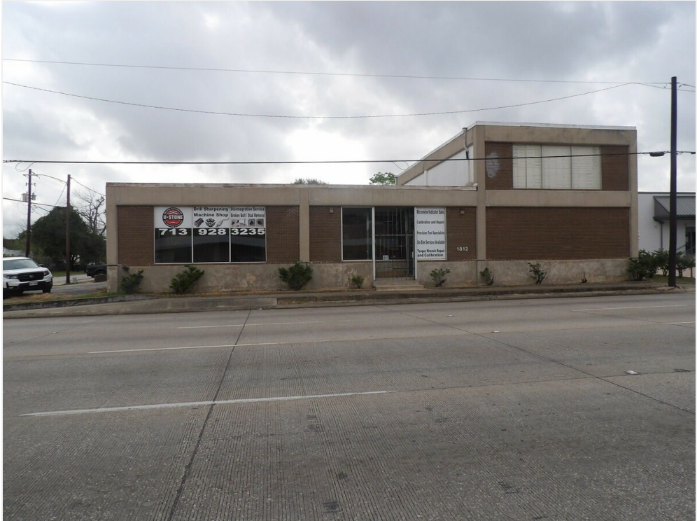
Front Elevation 1812 Wayside