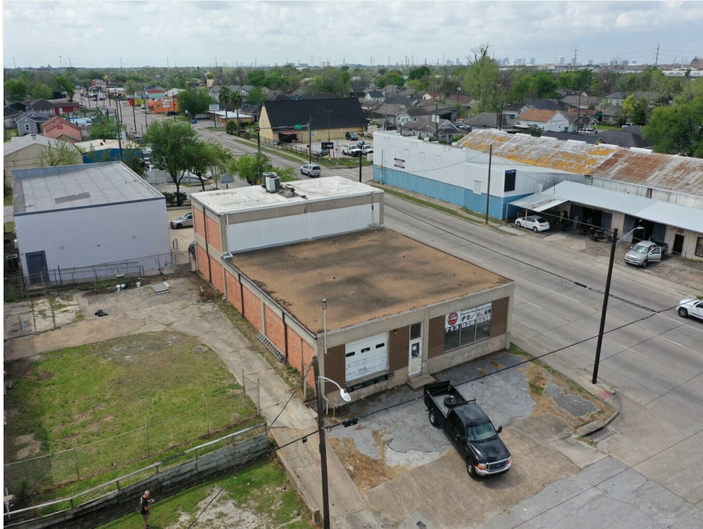
Aerial View of Office/Showroom