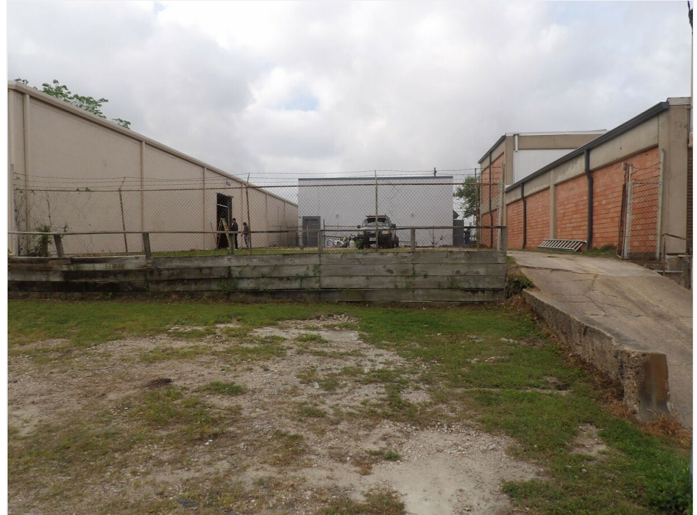
Yard between Warehouse & Office Bldg