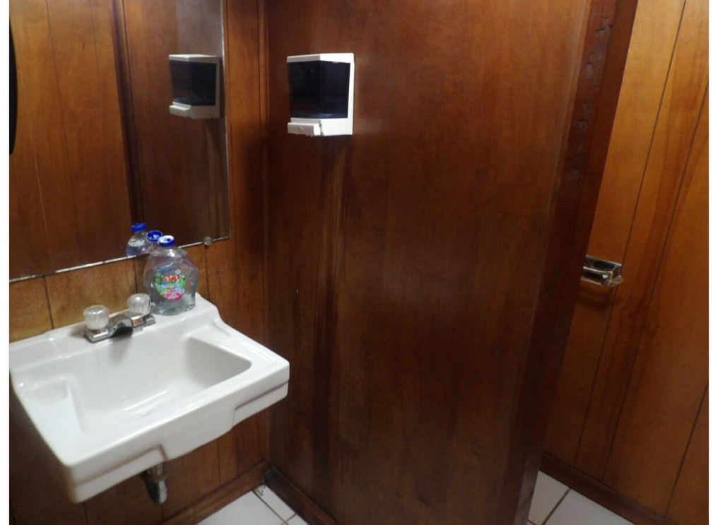
Restroom 1812 Wayside