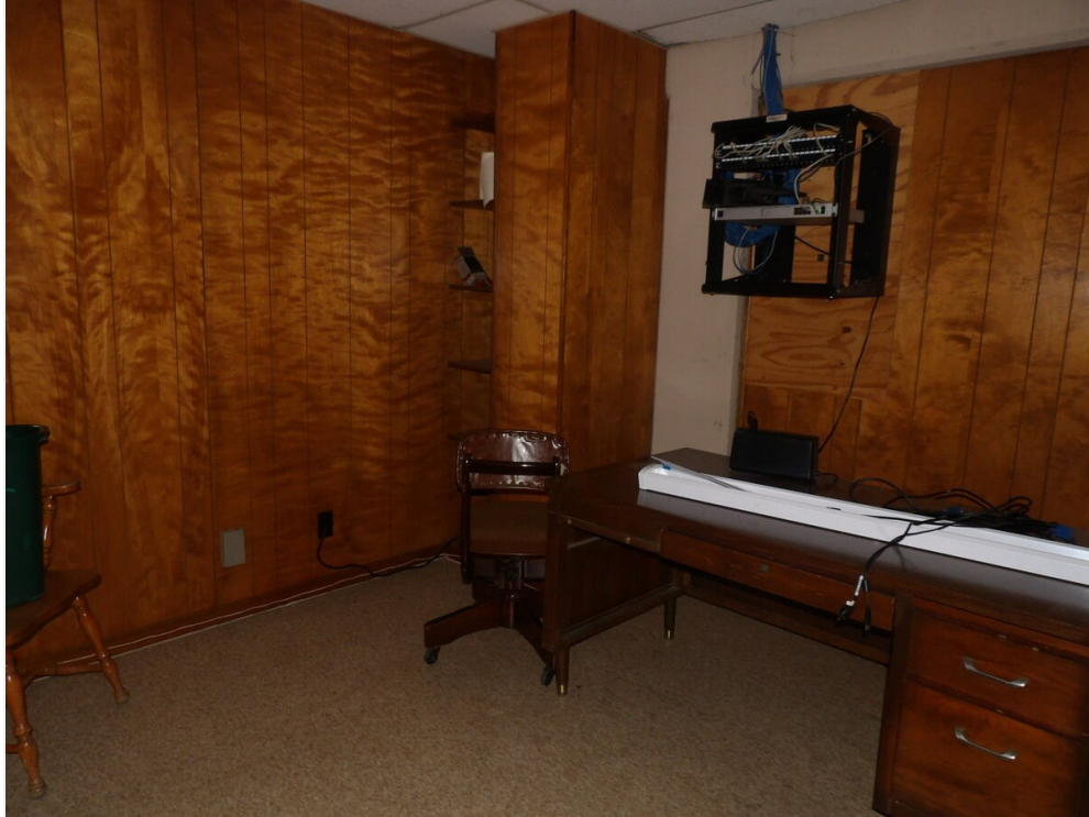
Upstairs Office (2) 1812 Wayside