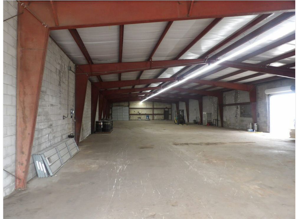
Warehouse on 6808 Ave S