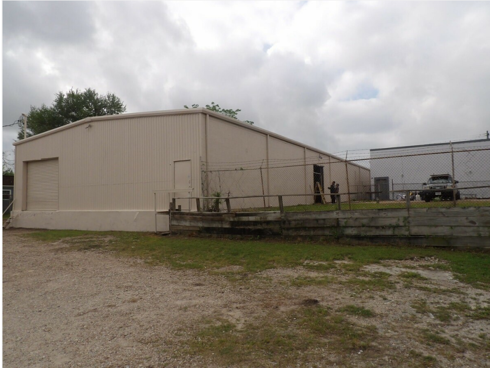
Warehouse From 6808 Ave S