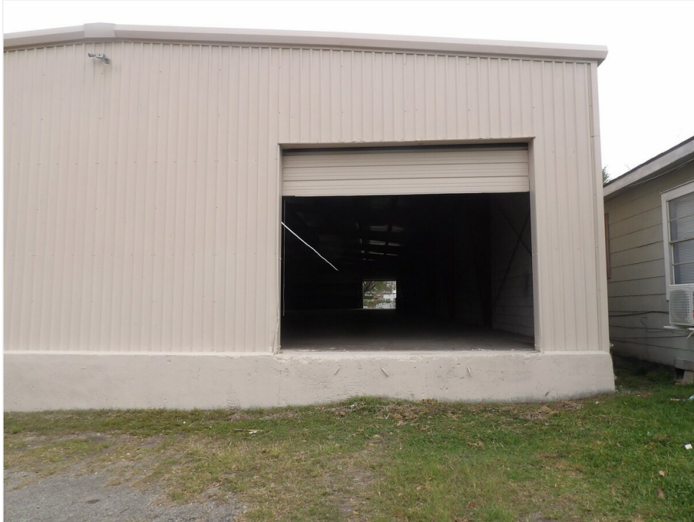
View from Ave R