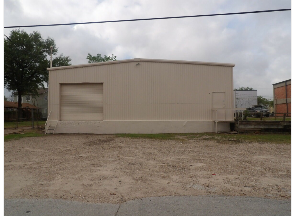
View from 6808 Ave S