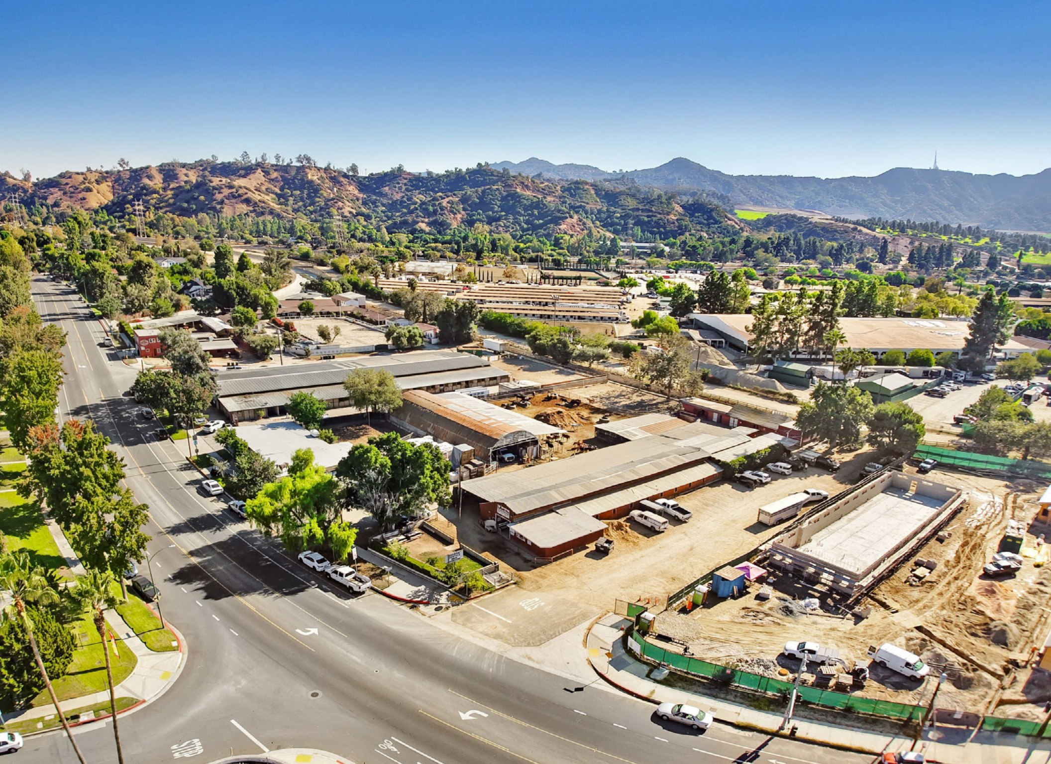
1840 RIVERSIDE DR.