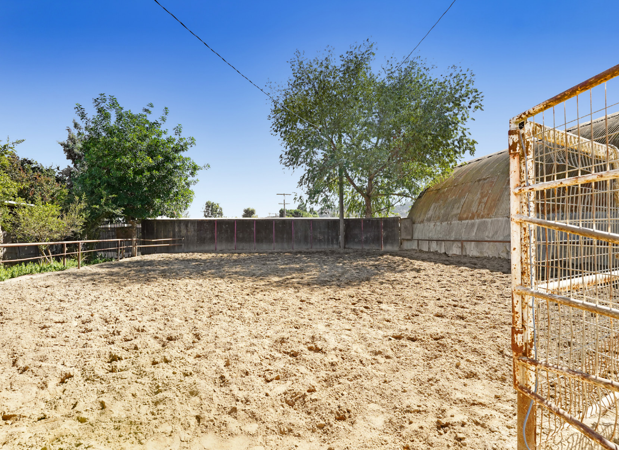
1840 RIVERSIDE DR.