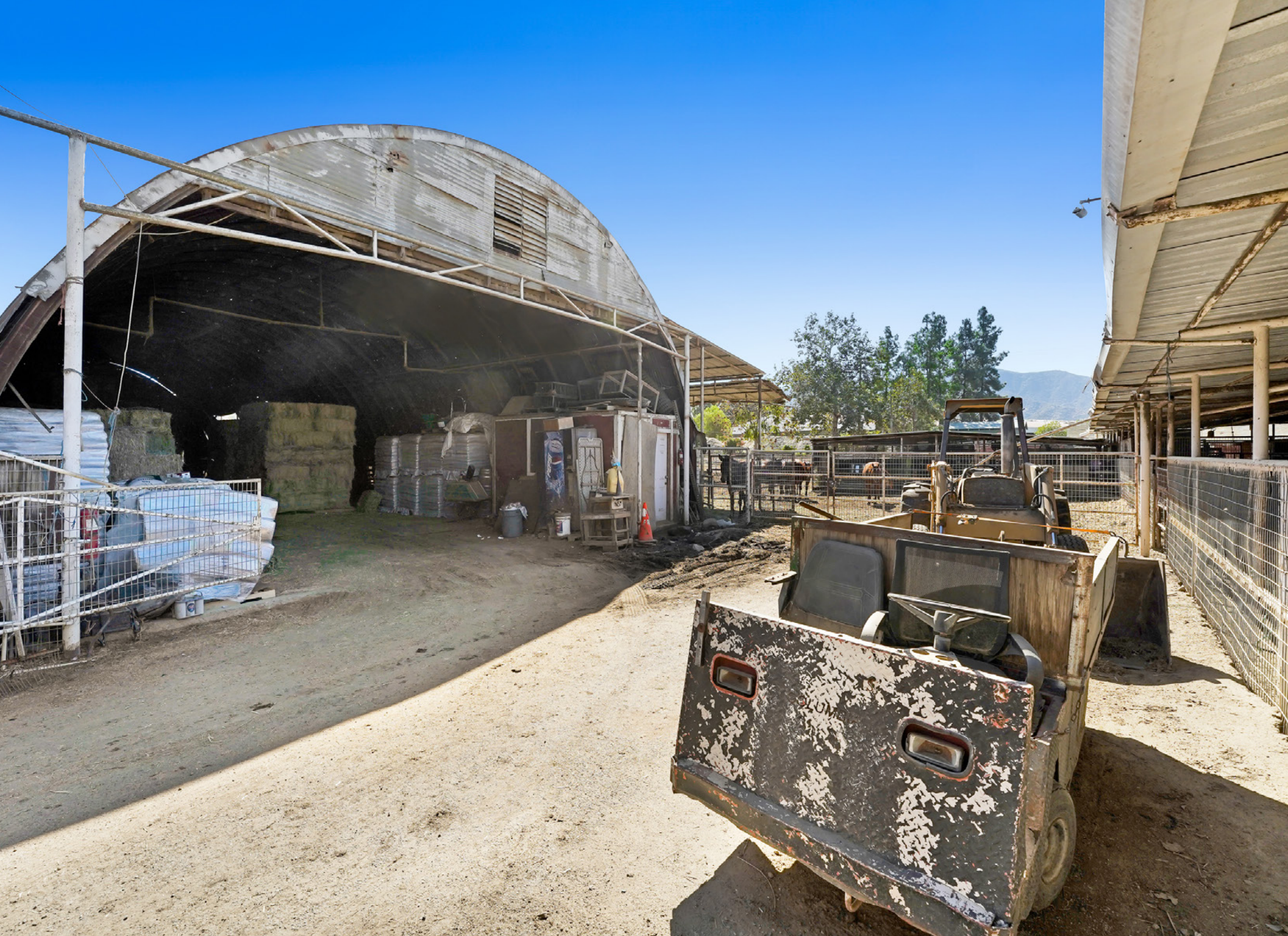
1840 RIVERSIDE DR.