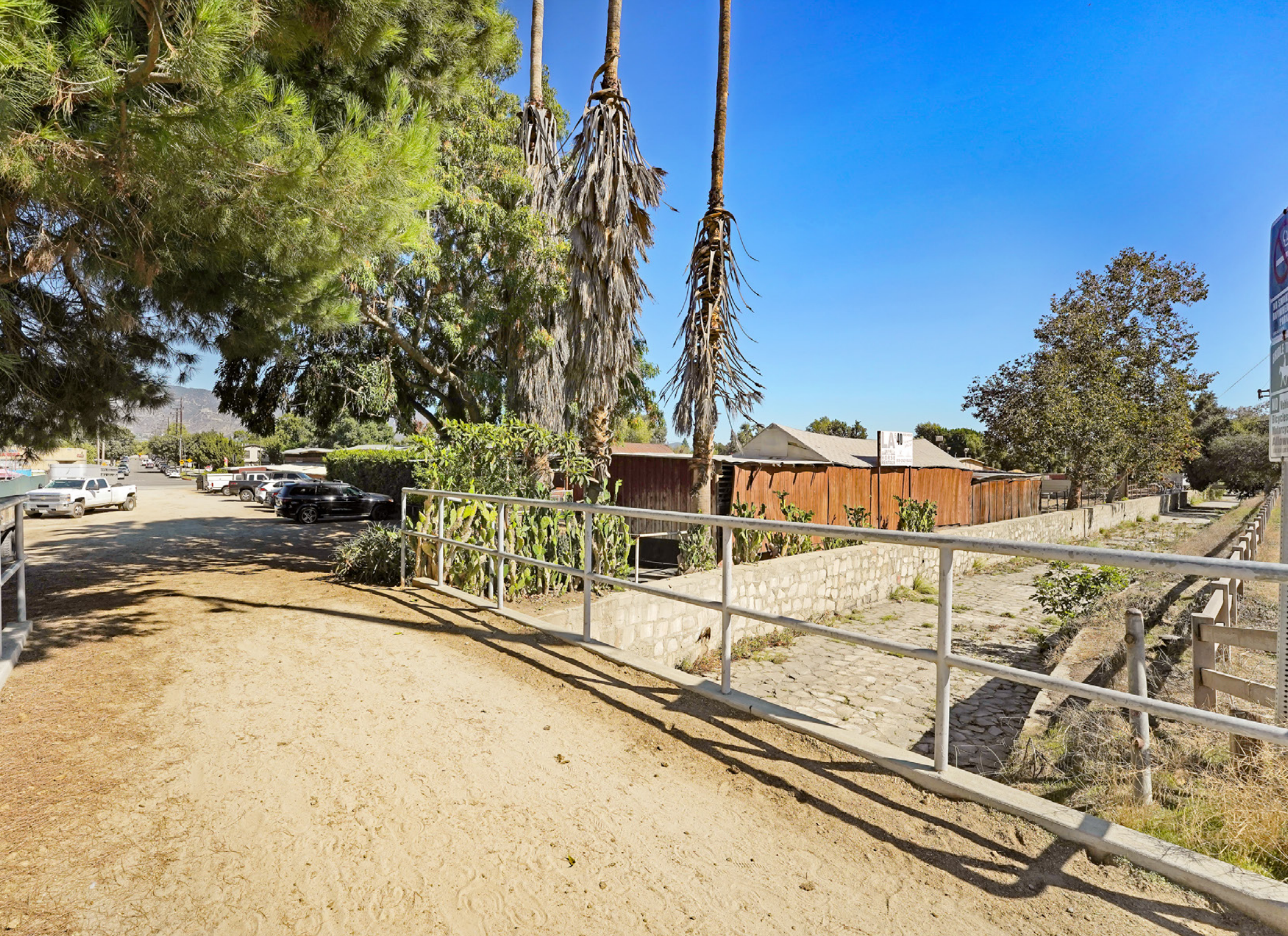
1840 RIVERSIDE DR.