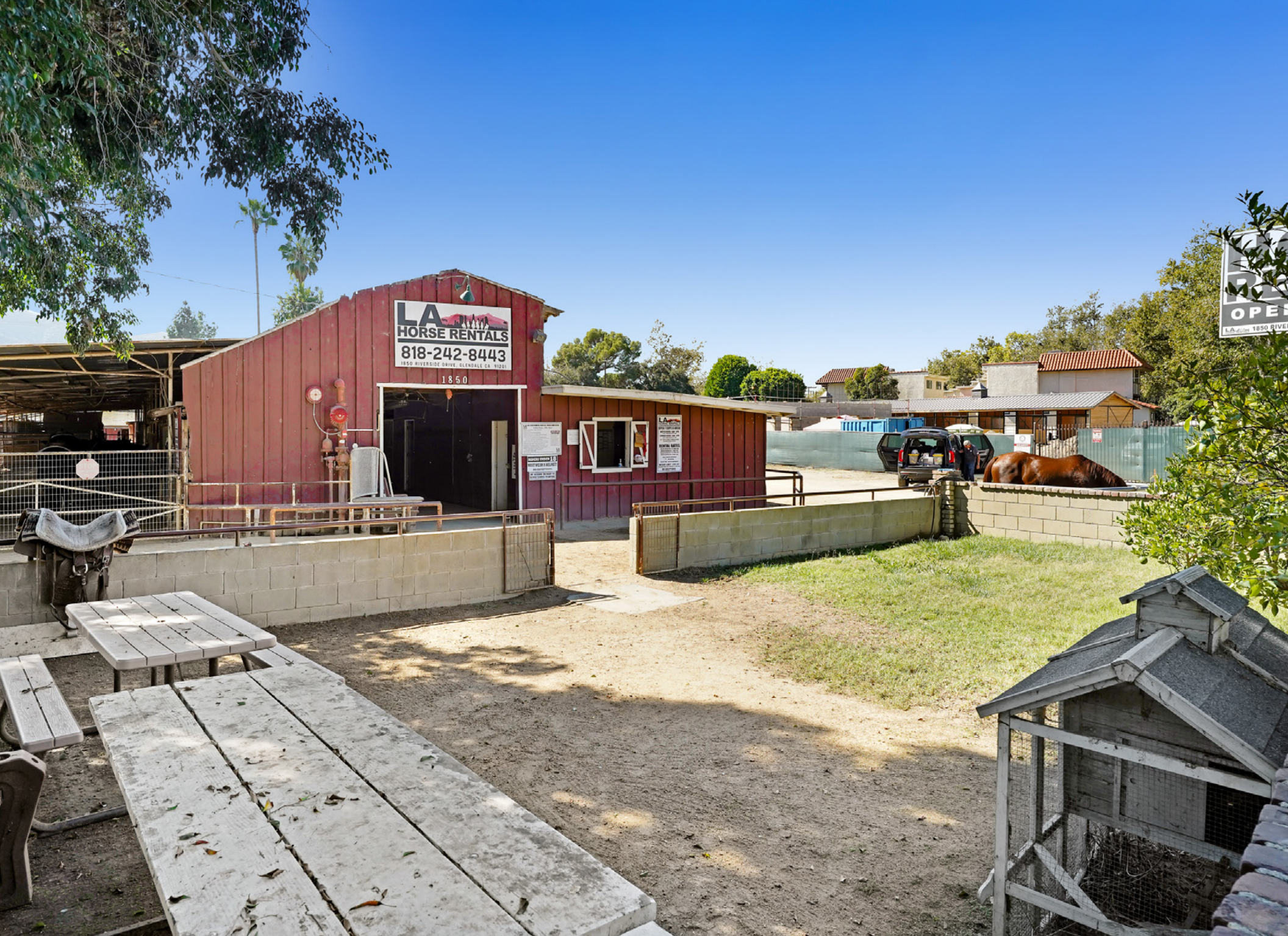
1840 RIVERSIDE DR.