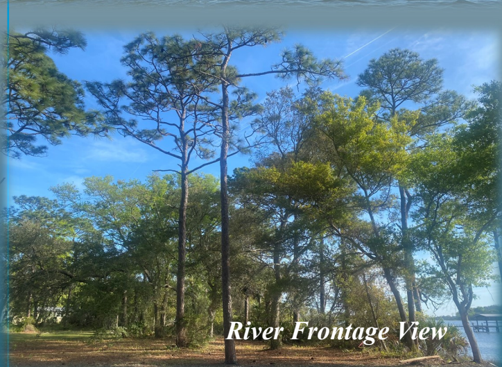
River Frontage View