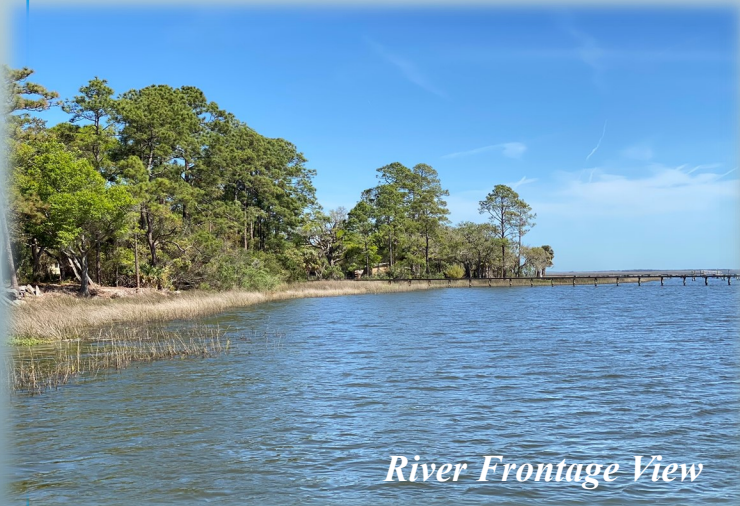
River Frontage View