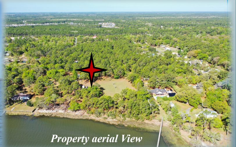
Property aerial View