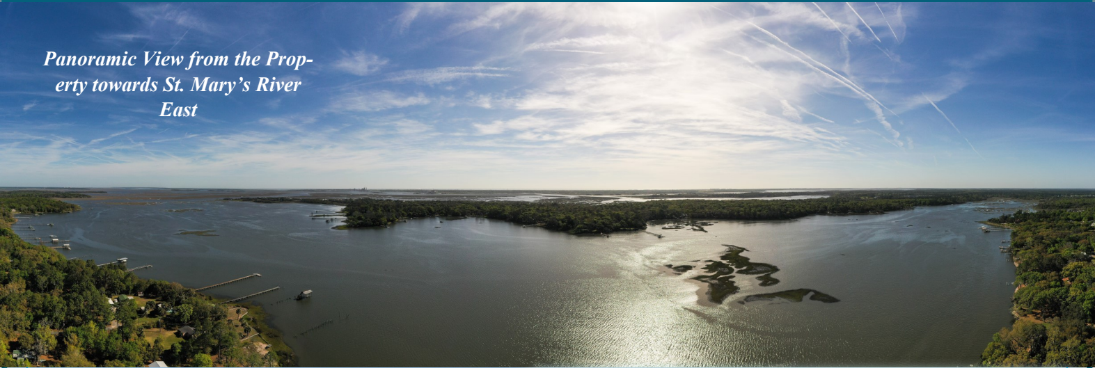
Panoramic View from the Property towards St. Mary's River East