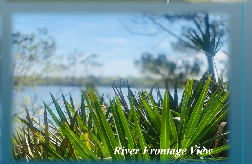
River Frontage View