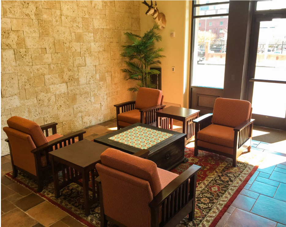
Conference Room Lobby