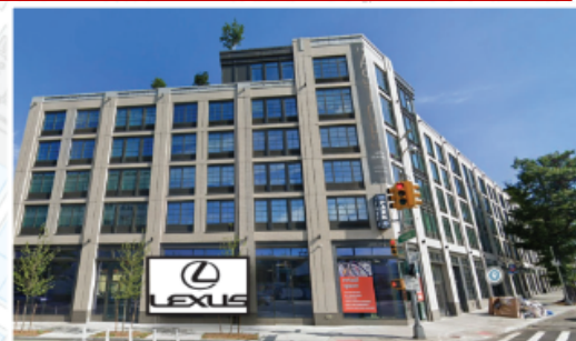
NEXT TO NEW LEXUS OF QUEENS SHOWROOM!