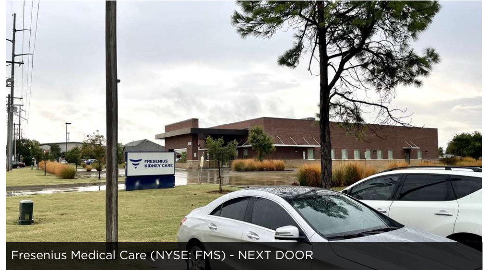
Fresenius Medical Care (NYSE: FMS) - NEXT DOOR