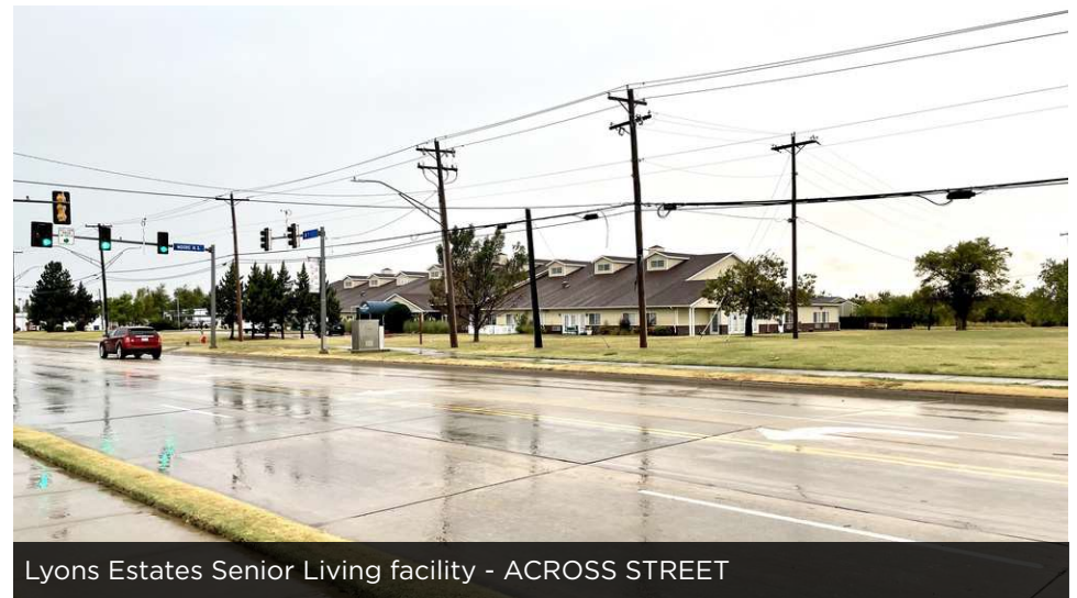
Lyons Estates Senior Living facility - ACROSS STREET