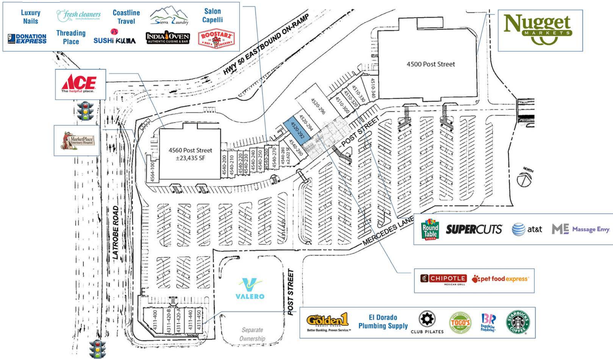
Site Plan - Subject To Change