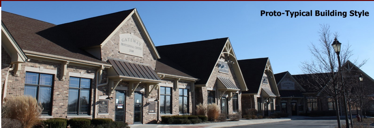
Proto-Typical Building Style

Close to Kishwaukee Hospital & the DeKalb Clinic