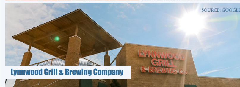
Lynnwood Grill & Brewing Company