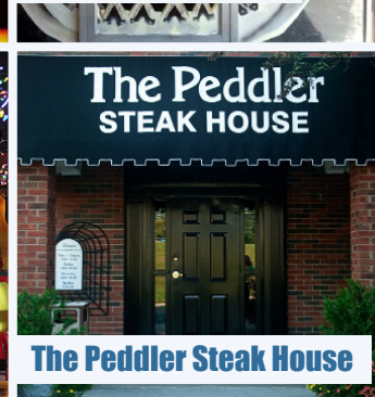
The Peddler Steak House