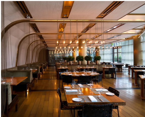
📍 CRAFT LOS ANGELES - 10100 CONSTELLATION