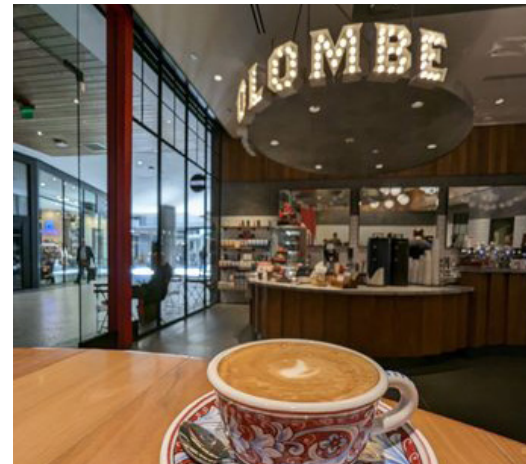
📍 LA COLOMBE - WESTFIELD CENTURY CITY