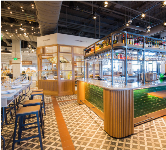
📍 EATALY - WESTFIELD CENTURY CITY