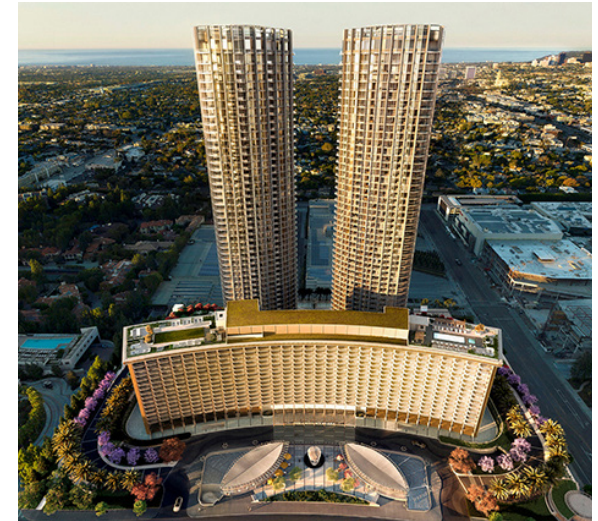
📍 FAIRMONT - CENTURY PLAZA