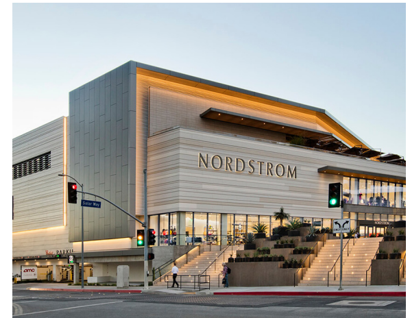
📍 NORDSTROM - WESTFIELD CENTURY CITY