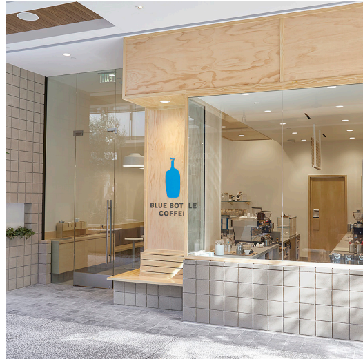
📍 BLUE BOTTLE - WESTFIELD CENTURY CITY